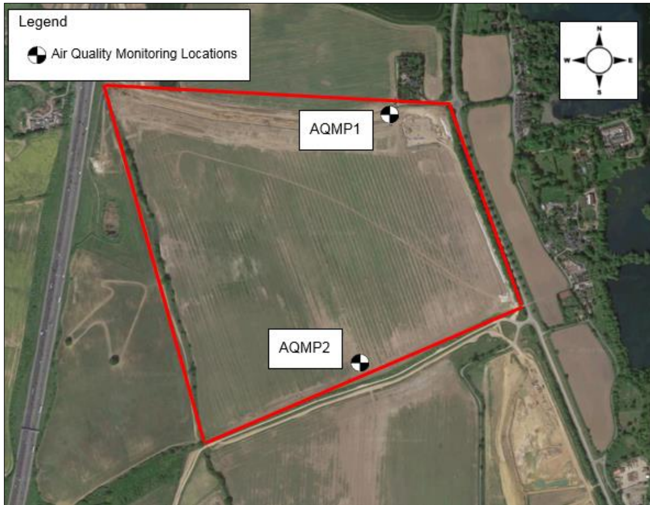
Figure 1: Worksites and Monitoring locations during October 2019