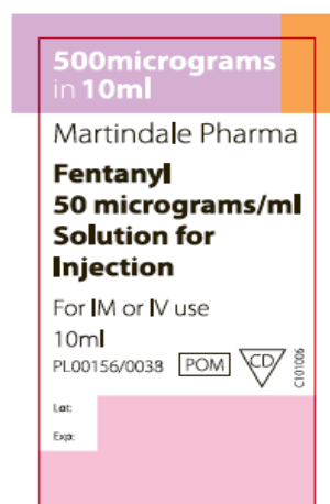
UK approved ampoule label