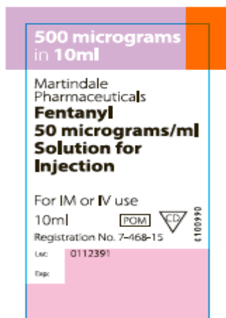
Ampoule label for batch 0112391R