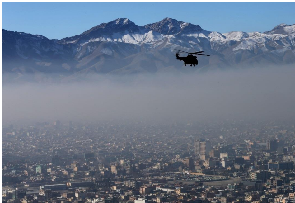
Figure 5: An RAF Puma deployed on Operation TORAL in Afghanistan

The UK's post 2014 contribution to operations in Afghanistan under the NATO RESOLUTE SUPPORT MISSION. Casualty and fatality statistics for operations VERITAS and HERRICK in Afghanistan (Oct 2001 to Dec 2014) have been published by MOD on a monthly basis since 2006. They can be accessed here (they are now located under Historical National and Official Statistics on the MOD National and Official Statistics by topic page of the website).