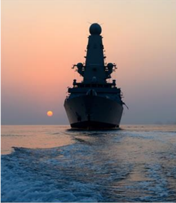
Figure 3: Type 45 destroyer HMS Dragon pictured in the Middle East during Op KIPION 2013

Due to the numbers of RFA 4 personnel deployed on Op KIPION, a table has been included presenting the number of UK entitled civilian casualties by financial year.