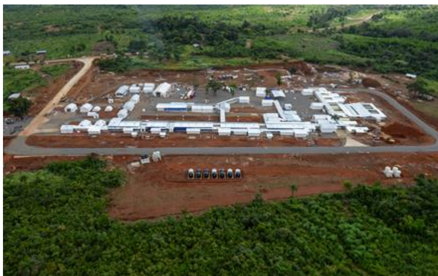
Figure 4: The Kerry Town Treatment Centre in Sierra Leone near the capital Freetown.

An Ebola treatment facility opened on the 5 November 2014 in Kerry Town, near the Sierra Leone capital Freetown. This facility was run by UK military until 30 June 2015 when it was handed over to Aspen Medical by the deployed military team. The Kerry Town complex included an 80-bed treatment centre managed by Save the Children and a 12 bed centre staffed by UK military medics specifically for health care workers and international staff responding to the Ebola crisis. This section focuses only on those patients that were admitted to the 12-bed health worker treatment centre run by the UK military.