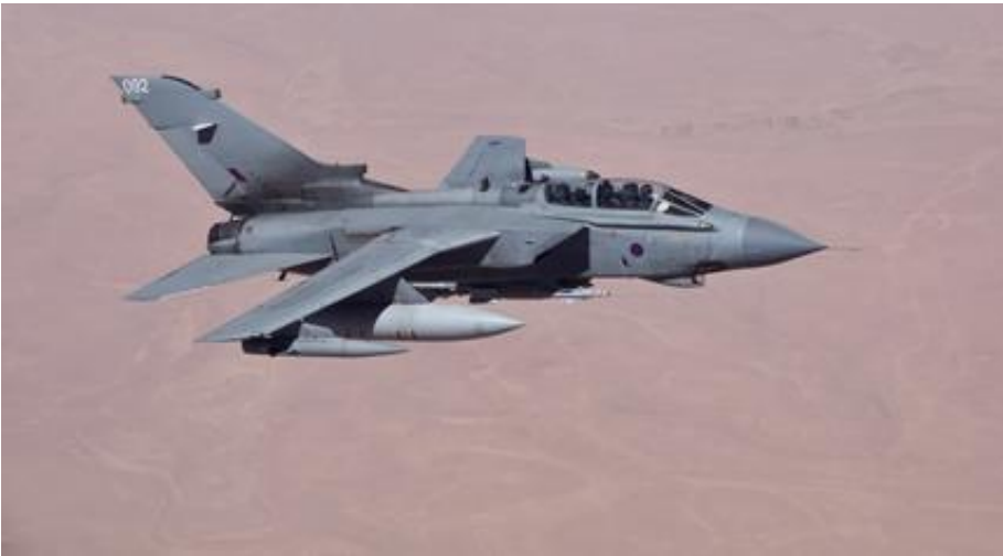
Figure 4: RAF Tornado GR4's over Iraq on an armed reconnaissance mission in support of Op SHADER.

During the latest six-month period, 1 April and 30 September 2019 (Q1/Q2 2019/20), there were no UK entitled civilians who died, sustained an injury or had an illness whilst on Op SHADER.