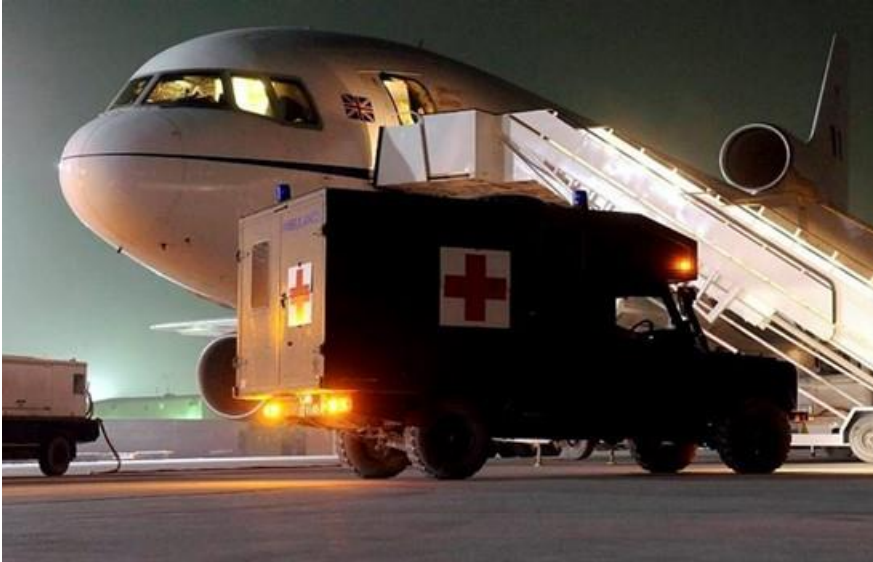
Figure 2: An Army ambulance is pictured next to a Royal Air Force Tristar aircraft at Kandahar Airfield in Afghanistan, after transporting a casualty for evacuation.

During the latest six-month period 1 April to 30 September 2019 (Q1/Q2 2019/20), there were no UK entitled civilians who sustained an injury or illness whilst on operations.