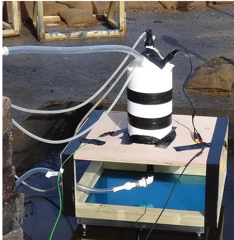
Figure 2. The filter funnel assembly pot used to dry solid powder explosives, the final stage in the manufacture process. Within the assembly pot (at the bottom), the solid explosive is present on filter paper.

The primary container will be provided by DstI and will vary significantly depending on the particular application. It may be made of glass, plastic, cardboard or metal. (Where sample tamping is required the primary container will be of a suitable strength.) Sizes will vary from a 6 mm diameter tube to a 300 mm diameter pot.