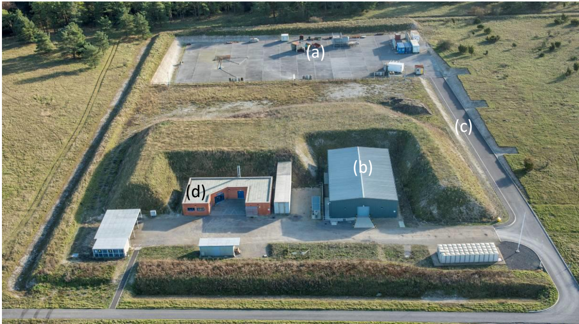
Figure 2. The Home Made Explosives Facility and Centre of Excellence at Dstl, Porton Down – the FACILITY. Key locations are indicated where the remote handling solution(s) are to be deployed. (a) The PAD – where explosive manufacture and explosive disposal processes will be performed. Other processes may also be undertaken here (these are described in Section 4). (b) The DETECTION SUITE where equipment will be setup and to where the primary/secondary container must be delivered to /from the PAD. (c) The approximately 100m length of road with a gradual incline with a total rise height of 7m that must be traversed to transport between the PAD and the DETECTION SUITE. (d) The CONTROL ROOM where operators would be situated for any remote control of the remote handling processes.

The UK Government Facility where the remote handling capability is to be deployed is the Home Made Explosives Facility and Centre of Excellence located at Dstl, Porton Down site (subsequently referred to in this report as the FACILITY). A photograph of the Facility is given in Figure 2 with key locations indicated. These locations will be referred to in Section 6 where the sub-requirements are described.