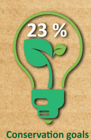
Conservation goals "Mitigating and adapting to climate change"

Up to a quarter of UK social enterprises and CICs already contribute directly to environmental aims. Of these, activities are mainly centred around: