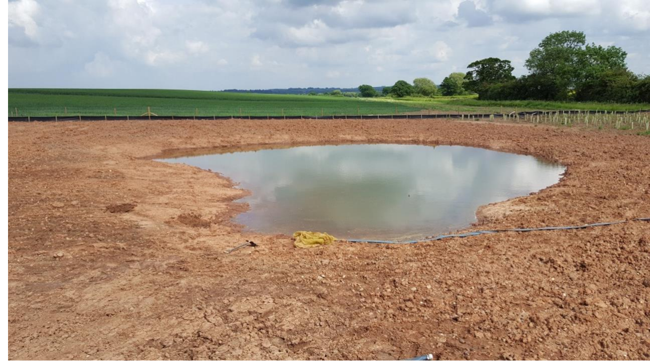
Example layout and ecology ponds