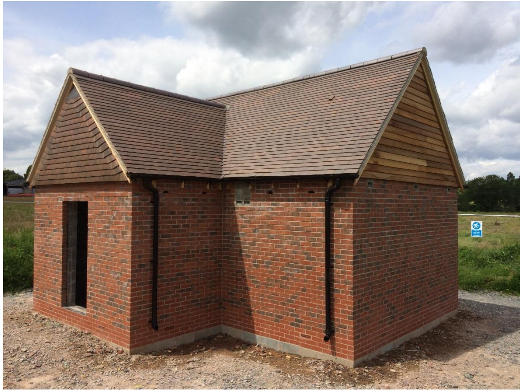
Bat house and woodland planting.