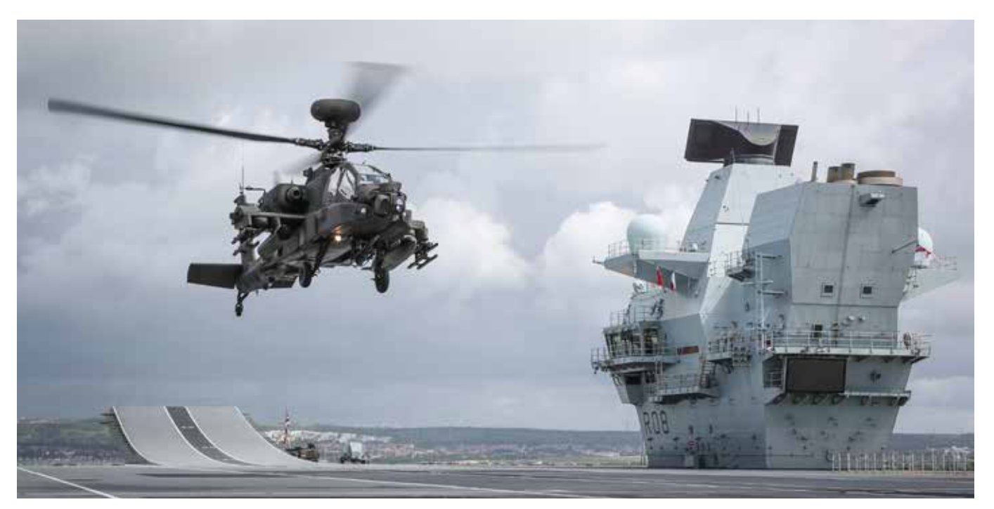
Pictured: Apache debuts on HMS Queen Elizabeth