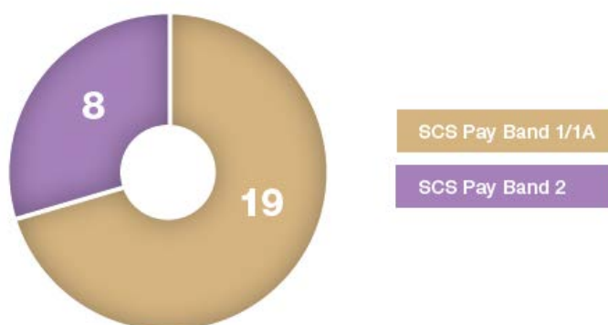
Figure 18 Senior civil servants as at 31 March 2019 41