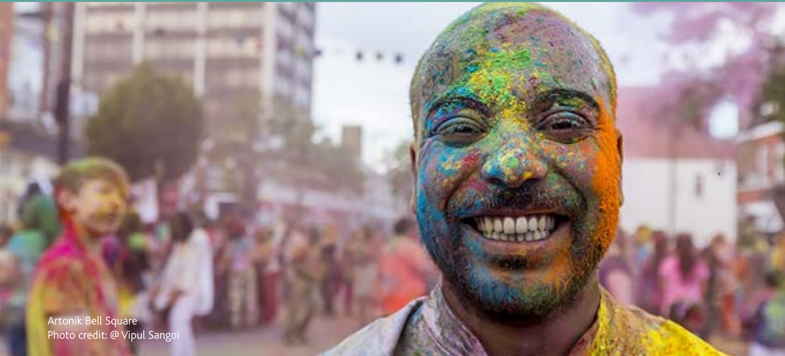
Artonik Bell Square

Arts and culture, including museums and libraries, make a substantial contribution to the UK and local economies, creating an estimated £29.5bn for the UK economy in 2017 (1.6% of the total). 16 This has increased by 38.5% since 2010. For every £1 of Gross Value Added (GVA) generated by the arts and culture industry, an additional £1.30 of GVA is generated in the wider economy. 17 In 2017, the culture sector directly supported 674,000 jobs, 2% of the UK total. 18