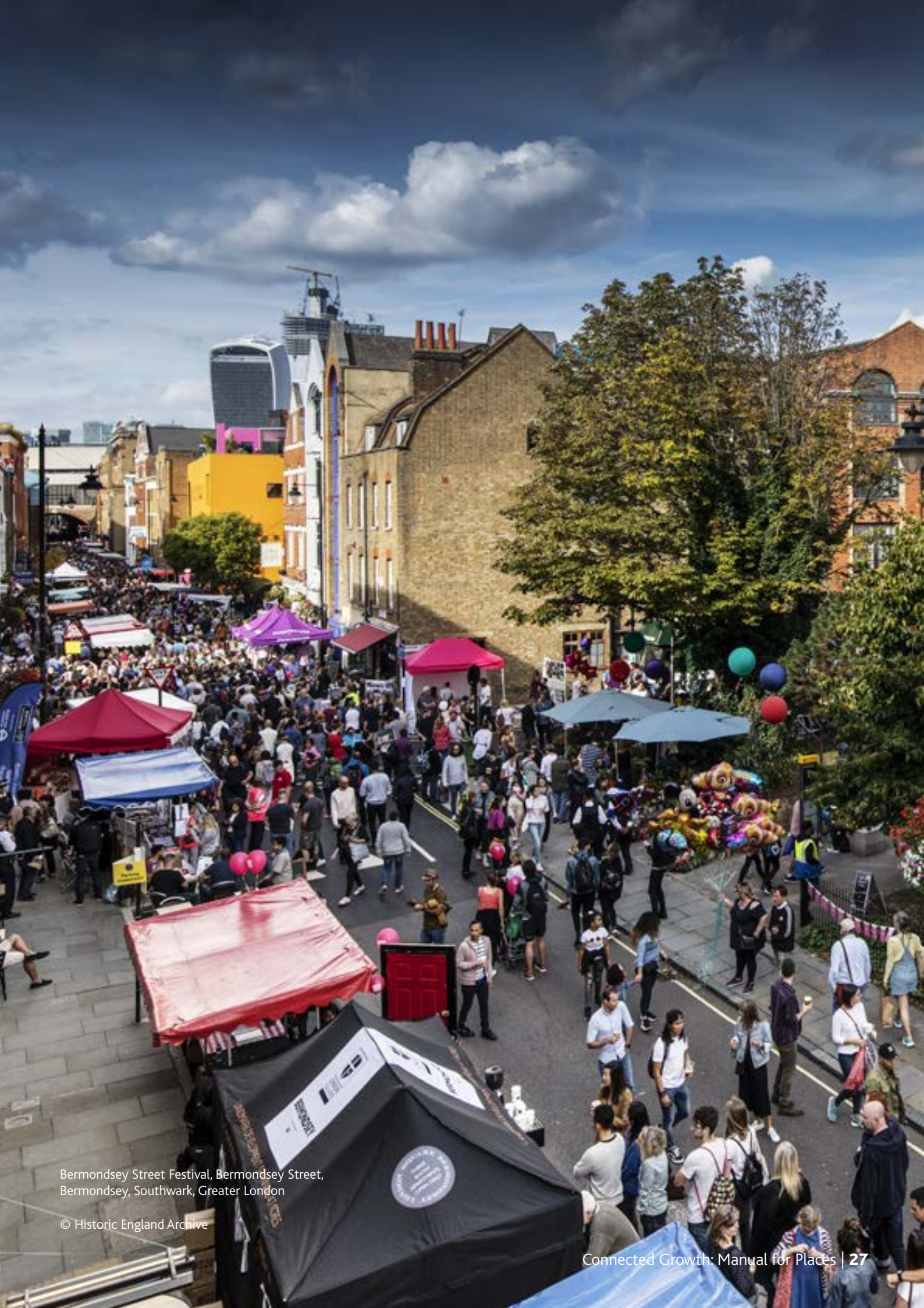
Bermondsey Street Festival, Bermondsey Street, Bermondsey, Southwark, Greater London