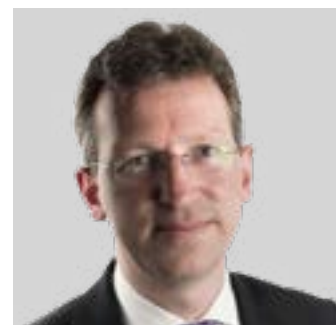
Rt Hon Jeremy Wright QC MP

I am proud to present the work which my Department, and our colleagues in the arms-length bodies we support, such as the Arts Council and Sport England, are doing to help places flourish. I hope Local Enterprise Partnerships and other policy-makers will make good use of this manual and help our sectors to make their full contribution to local prosperity.