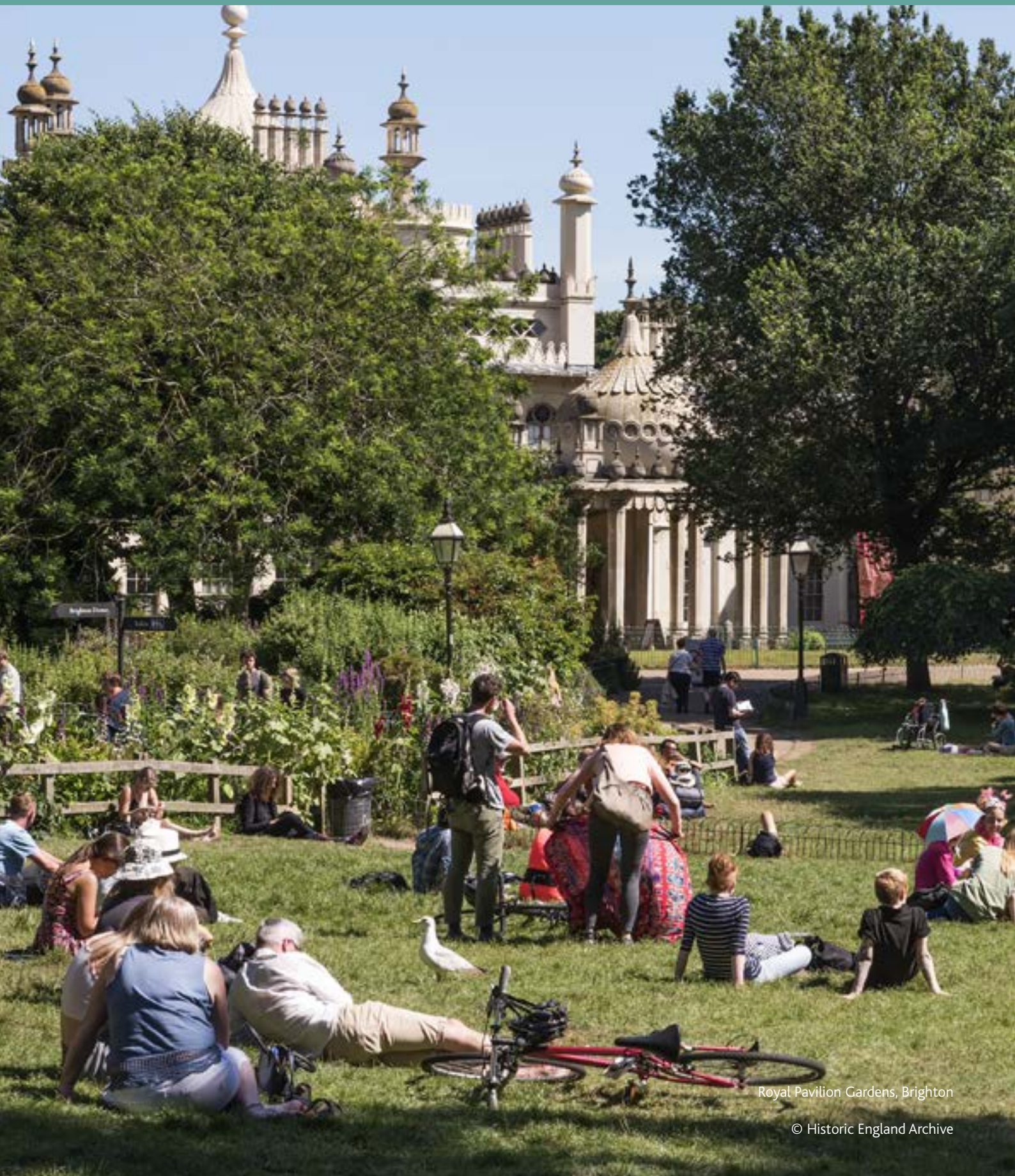
Royal Pavilion Gardens, Brighton