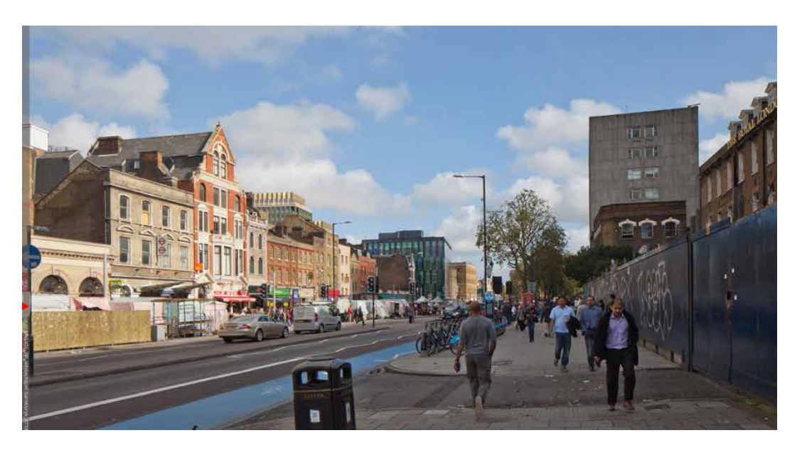
Illustration 2: Looking east along Whitechapel Road with proposed development<sup>121</sup>.

11.4 Turning to the street scene including the WLI, this is more sensitive to impact from taller buildings behind the street frontage. However, from opposite the fine-grained historic buildings noted in the CA Appraisal, Building 3 would be further away, and would mostly appear in oblique angles in views along the road. It would generally be out of site when standing on the same side of the road near the market stalls. The latter also impose their own fascinating character which leads the eye away from the wider context. For these reasons, although there would be harm to the CA, which should be given considerable importance and weight, the impact on both its character and appearance should be given only slight to moderate weight. [2.6 2.7 3.8]