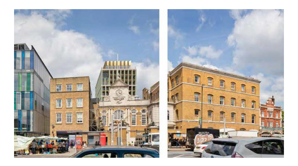
Illustration 3: Photomontage of the Brewery Entrance with Block 3 behind<sup>122</sup>