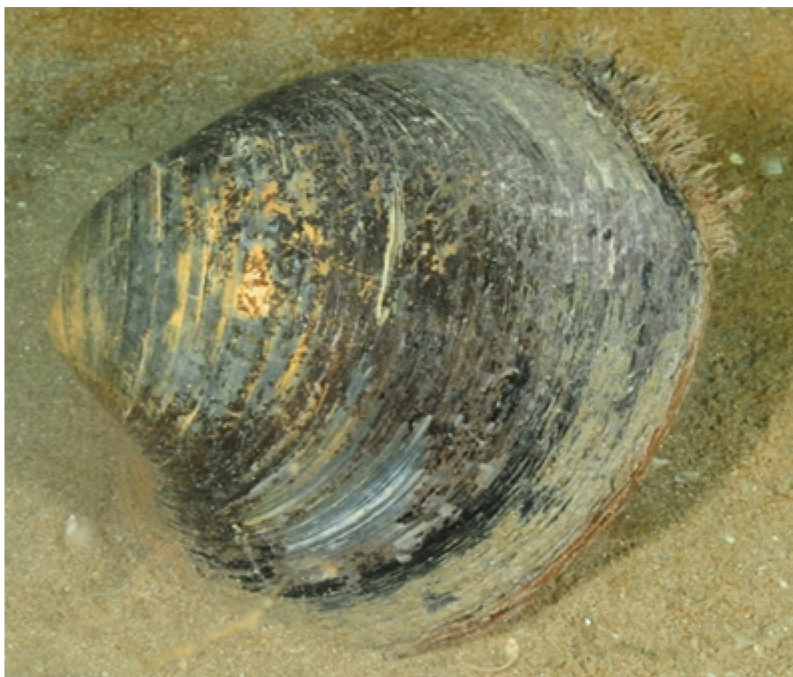
Ocean quahog ( Arctica Islandica )