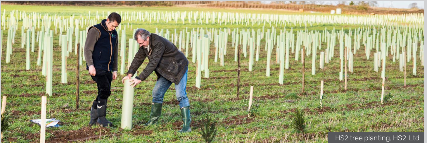
HS2 tree planting, HS2 Ltd