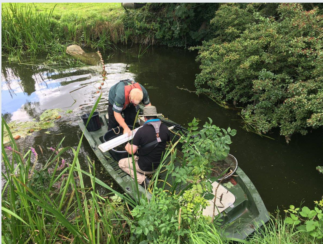
Fish monitoring survey on River Len in Kent.

You can look at our Catchment Data Explorer for more information.