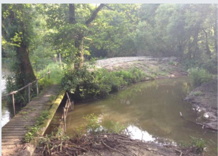
Silt trap at Scarletts Lake, Kent