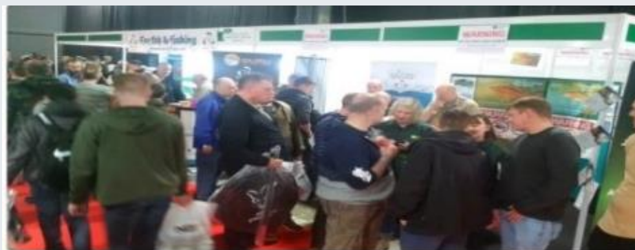
Northern Angling Show

For further information please contact Andy Eaves