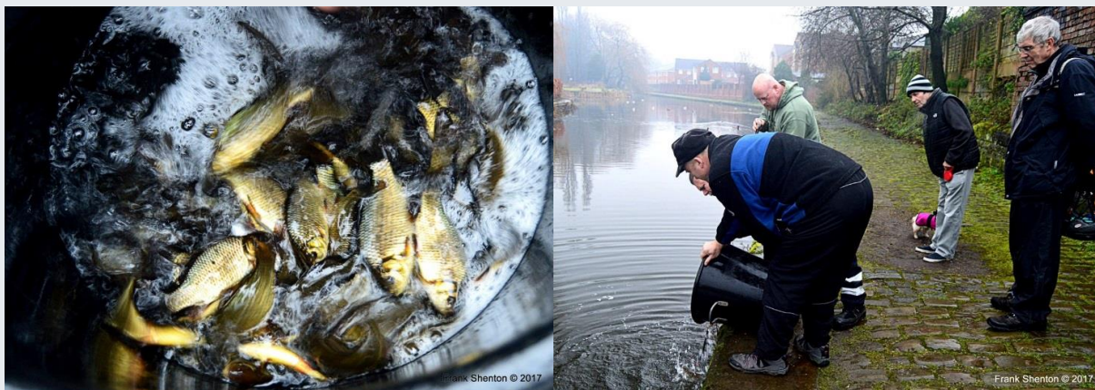
Fish restocking from our fish farm in Calverton

A Christmas present for anglers who fish the Manchester, Bolton & Bury Canal. A big thank you to @NWFishEA @EnvAgencyNW @FishFarmEA for working with Little Britain Anglers to secure these fish for local anglers (a nice mix of Crucian Carp, Tench, Roach, Rudd & Bream).