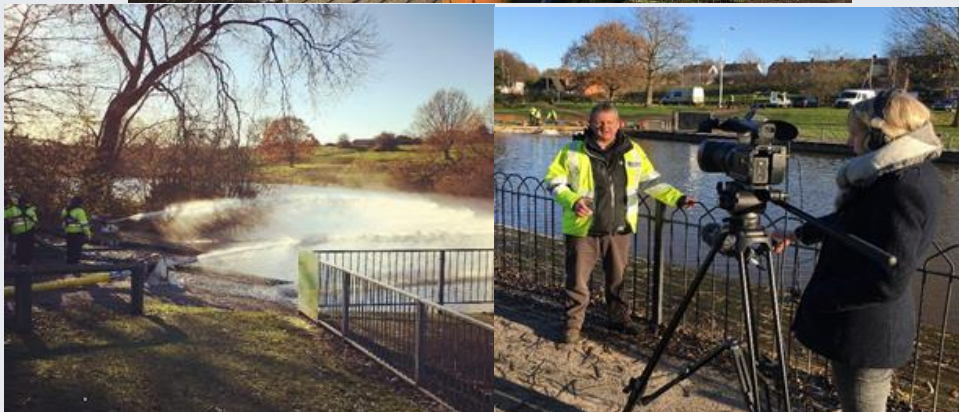
Operation at River Weaver