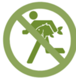
Close season boat patrol, River Mersey March 2018

87 illegal fishing incidents were reported to our incident hotline (0800 80 70 60)