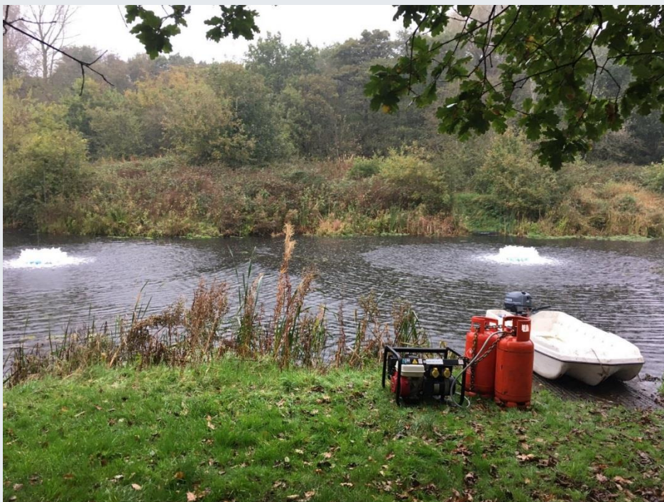
Aeration deployed for algal dieback St Helens AC

GMMC Fisheries dealt with 152 incident reports, varying between illegal fishing, fish mortalities and pollution incidents.