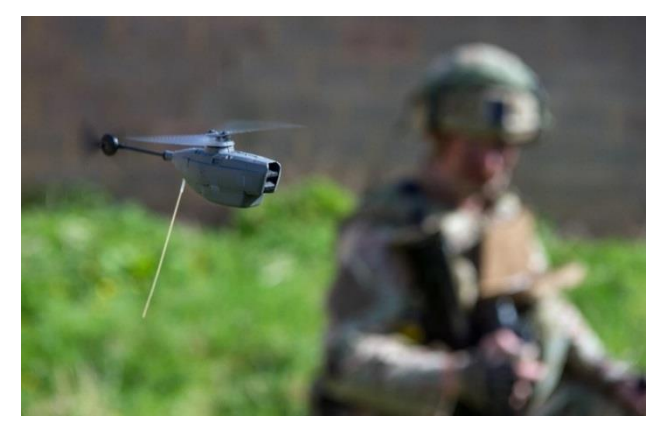
Pictured is a Royal Marine controlling a Black Hornet 2 Remotely Piloted Aircraft System