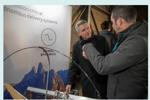
Pictured is a Dstl innovation event

The project, called <u>SME Searchlight</u><sup>9</sup> aims to attract non-traditional defence suppliers and SMEs to help deliver a projected £40 to £45 million increase in Dstl research spending with external companies.