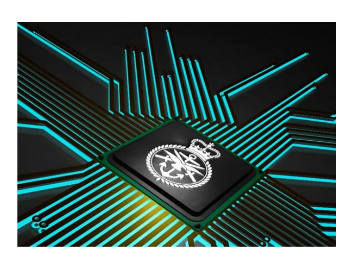
A computer graphic image (CGI) of the MoD Badge illustrated within an Information Technology circuit board