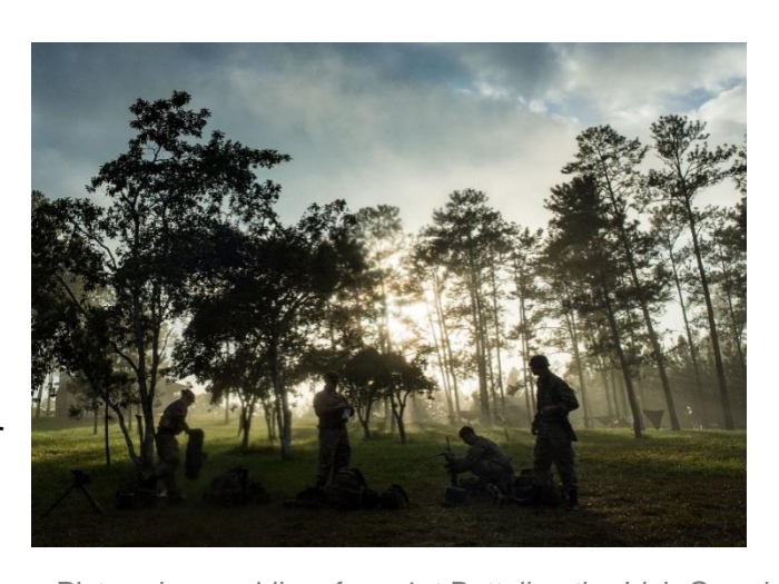
Pictured are soldiers from 1st Battalion the Irish Guards conducting a live firing exercise

We have made sure that SMEs are well represented in our refreshed approach to the Defence Suppliers Forum (DSF), to realise a step change in our relationship with industry. Aligned with the DSF is our Defence SME Forum, chaired by the Minister for Defence Procurement, which gives SMEs an opportunity to share their views and experiences of working in defence