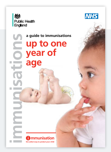
Immunisations up to one year of age weblink 1