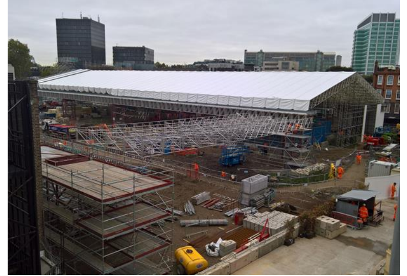
South tent with completed roof