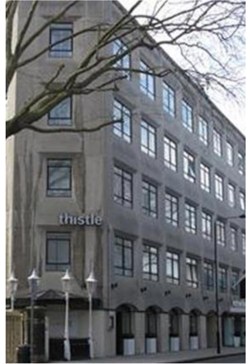
Built Heritage Recording of the Thistle Hotel – Pre Christmas 2018