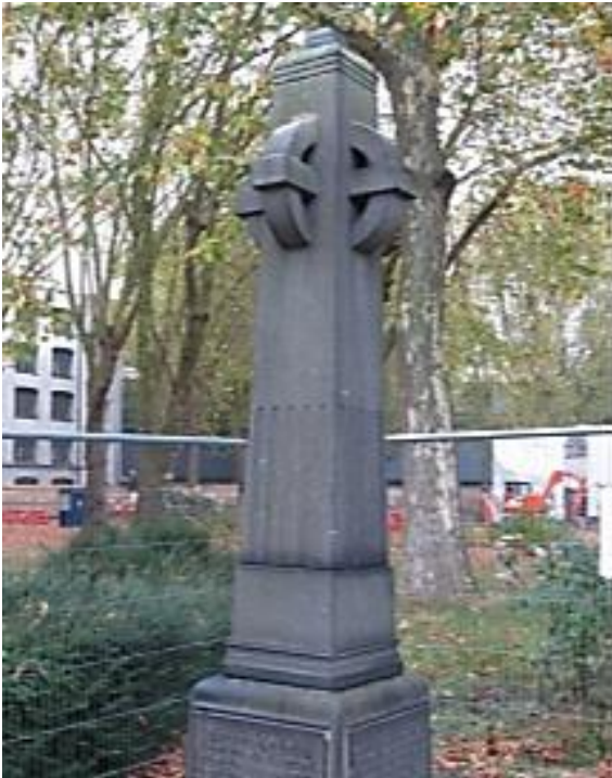
Dismantling of the Monument to the Christie Family – Jan 2019