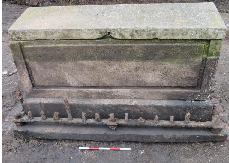
Substantial Chest Tomb in Area C

Over 700 funerary monuments have been recorded and retrieved. Most were not in situ however a number have helped us better map the plot system in use in the burial ground