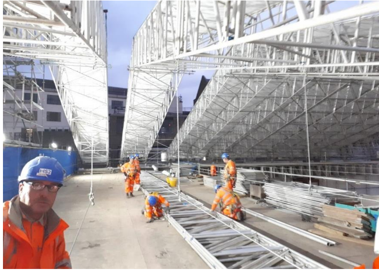
Rolling out the roof from working platform