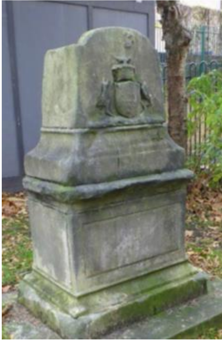
Dismantling of the Obelisk to Baron Southampton – Pre Christmas 2018