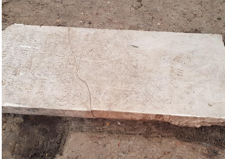
Topped monument found in backfill