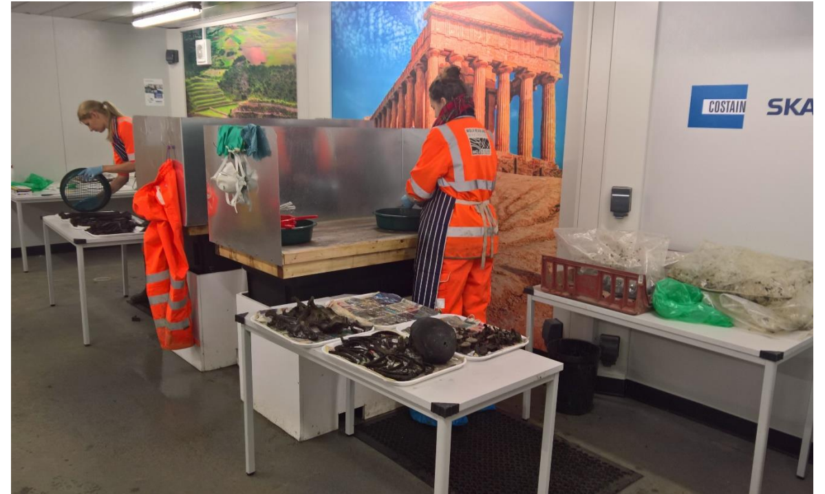
MHI staff working to process skeletalised remains