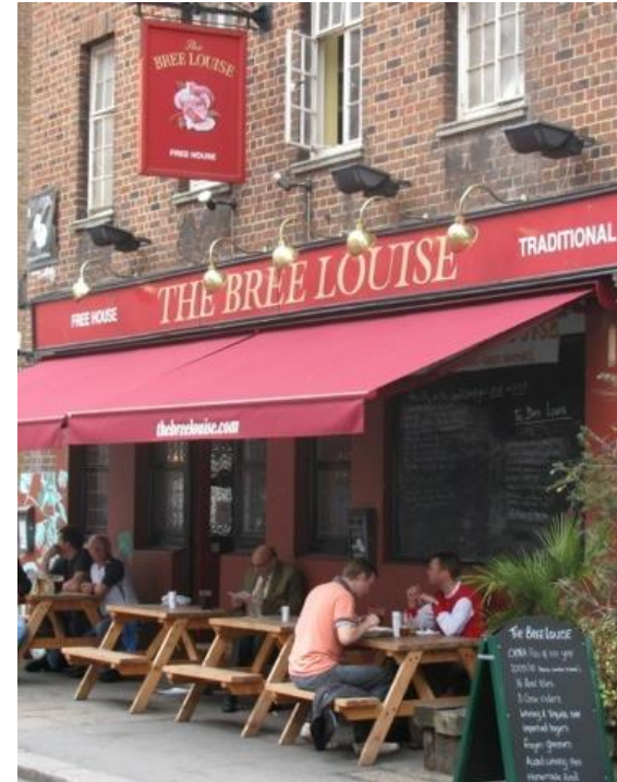
Built Heritage Recording of Bree Louise Public House – Jan 2019