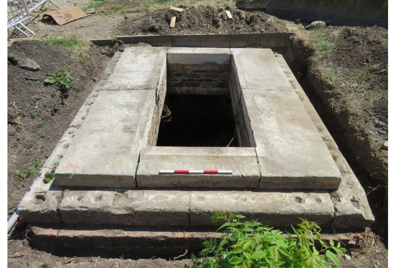
Opened vault in upper ground