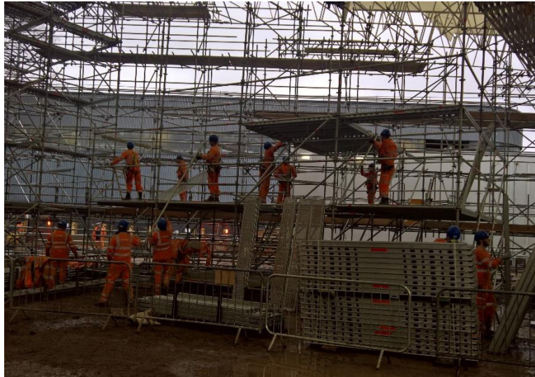
Striking bird cage scaffold