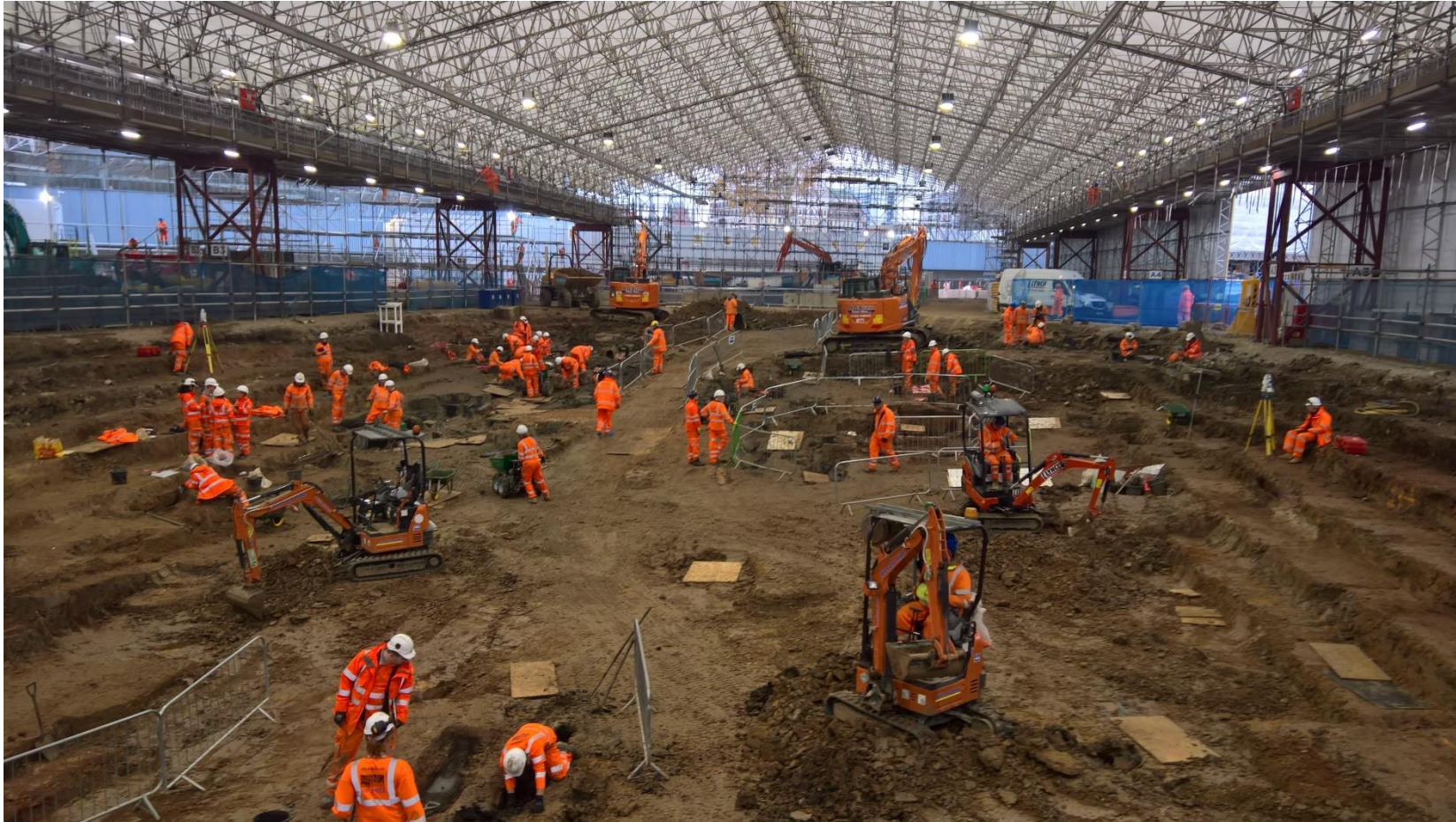
Image shows works taking place under Tent 2 at the south side of the burial ground

Work commenced in the Upper class area (Ground1)