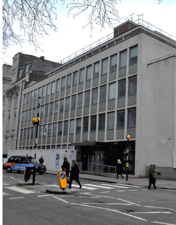
Built Heritage Recording of Walkden House – Jan 2019