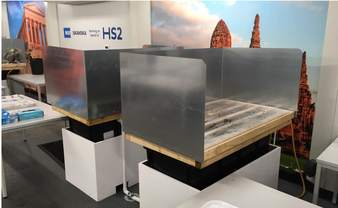
Ergonomically designed wash stations