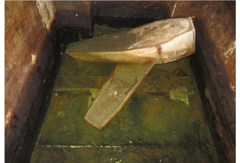
Lead coffins in Barrel Vault tomb