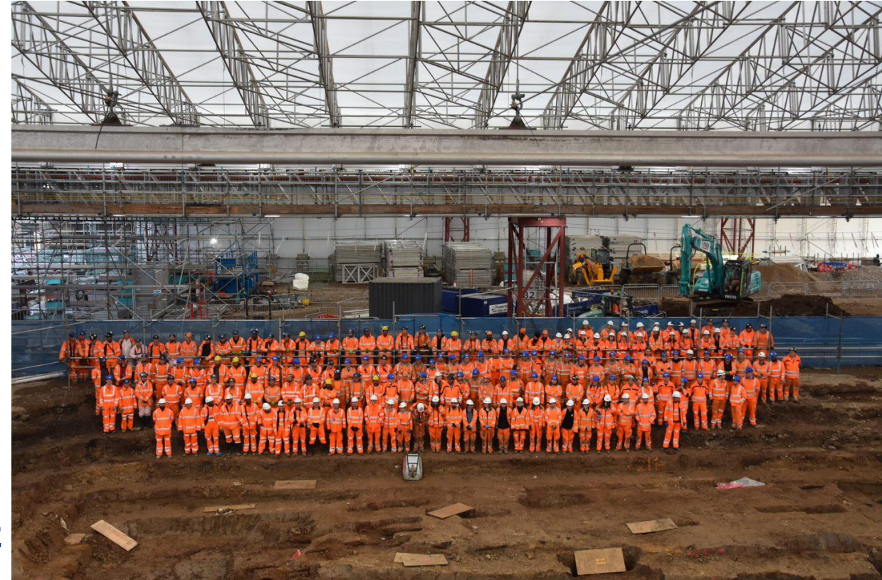
St James's Gardens Team Photo Nov 2018

The number of personnel gives an indication of the scale of what we are undertaking