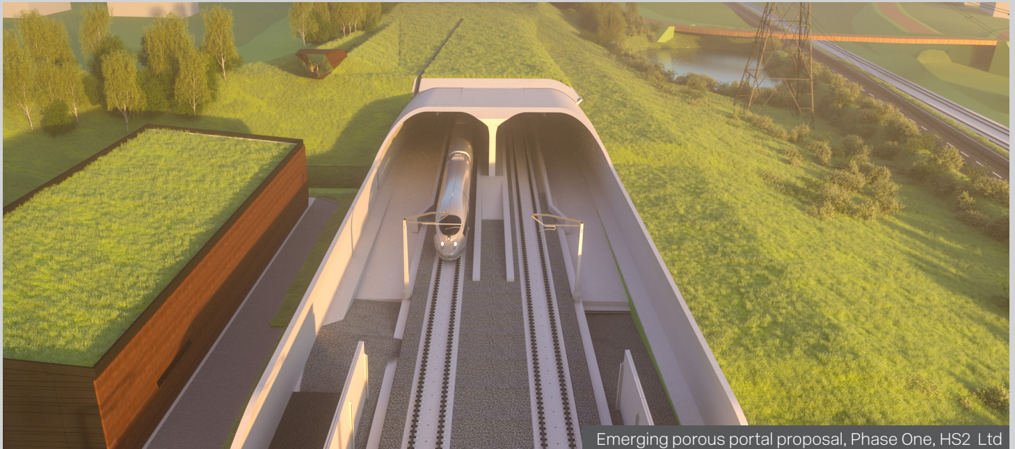
Emerging porous portal proposal, Phase One, HS2 Ltd