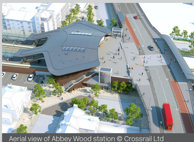
Aerial view of Abbey Wood station

While the panel thinks the thematic and topic gaps identified by HS2 Ltd are a fair representation of areas where guidance would be beneficial, it suggested further insights could be gained from the panel's existing recommendations – as well as through dialogue with other HS2 Ltd colleagues as the document evolves.