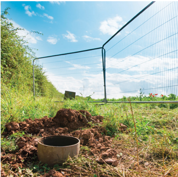
On completion, boreholes are filled or further instrumentation installed.