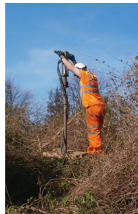
In difficult-to-access locations, hand-held equipment can be used.