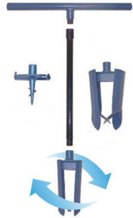
Hand auger borehole.

This method requires only one person and can usually be completed in a matter of hours.