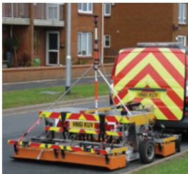
Large-scale ground-penetrating radar can be attached to a van.

Surveys can locate underground metal tanks, utility pipes and contaminated groundwater. They can also identify areas that need further geophysical or 'in-ground' investigation.