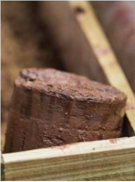
Core samples undergo physical and chemical laboratory testing.

Laboratory testing is divided into two broad categories: physical and chemical.