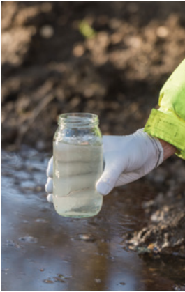
Surface water sampling.