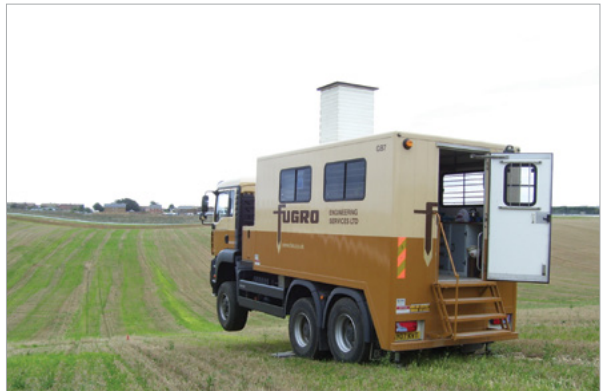
Cone penetration testing.

The cone is generally used to investigate less strong soils. Sensors on the cone can measure a variety of properties of the ground, including resistance, friction and water pressure. The results enable us to produce a profile of the layers the cone passes through and to assign properties to the different materials. This technique is normally used in rural locations where the ground is soft, such as flood plains. It requires two people, but tests are generally short (30-60 minutes) so they can carry out multiple investigations each day.