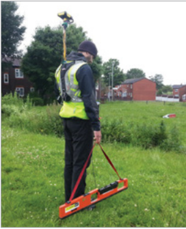
Electromagnetic conductivity.