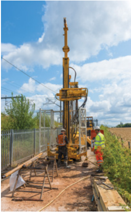
Drilling of a small borehole via a rotary core rig.

This technique uses a drill, mounted on the back of a truck or towed into position, to drill a small borehole into the ground. A diesel generator is needed – either on the truck or on a separate trailer.