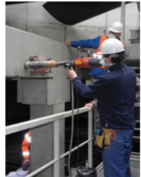
Concrete core (structural investigation).