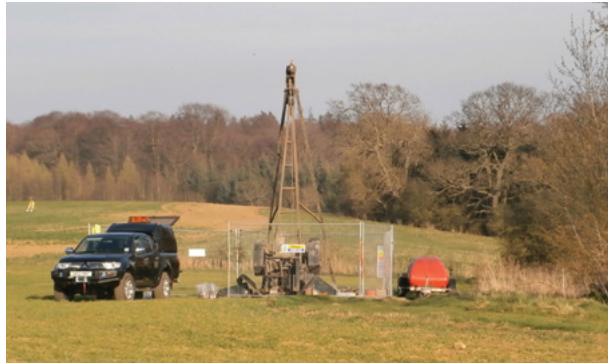
Cable percussion borehole.

A variety of tools are raised and lowered, either by a cable and winch or a series of steel rods, to drill the hole, take samples or carry out tests in the borehole.