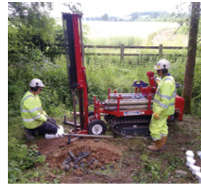
A motor-driven hammer pushes a cone into the ground for dynamic probing.

A steel tube is rotated into the ground to a depth of 5-10m. The tube is then extracted and a section of it is removed, or a flap is opened, to view a sample of the ground structure below the surface. Samples can be taken for laboratory testing. This technique can be used in multiple locations in one day, and in both urban and rural locations. It requires one or two people to operate.