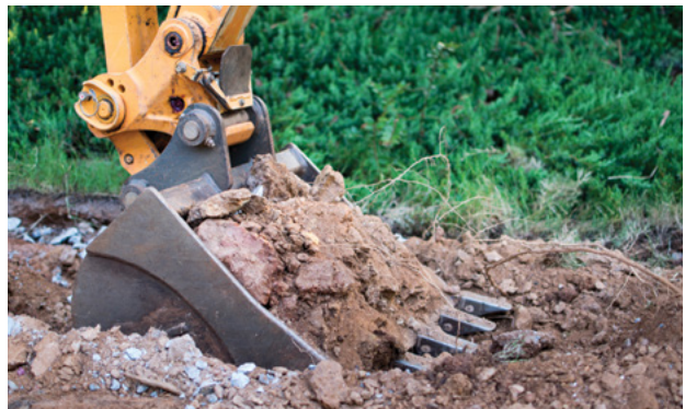
Pit or trench dug to investigate soil conditions from the surface and to obtain samples.

Pits and trenches enable us to observe the profile of the ground from the surface and obtain samples for testing. If it is critical to closely examine the ground, the sides of the excavation are shored with timber or a purpose-made support system before any work is carried out. Excavations reinforced in this way are called either observation pits or trenches.