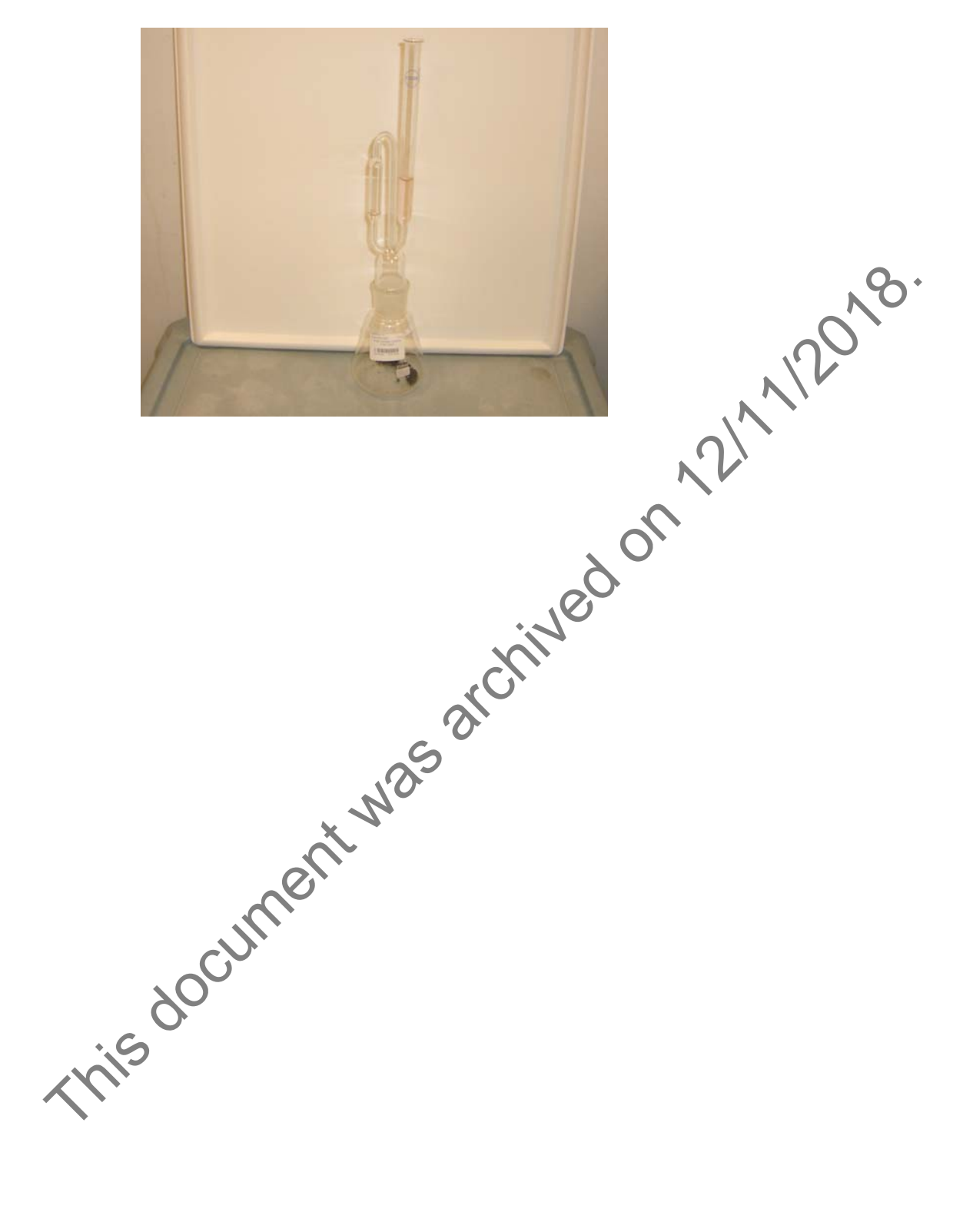
Figure E1 Glass bubbling equipment for collecting evolved gases