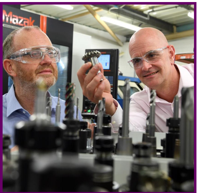
Manufacturing Growth Programme (MGP), multiple regions ERDF £10.46m; Total project value £20.07m

Delivered by Economic Growth Solutions (EGS), the MGP provides access to specialist assistance to help manufacturers to grow and improve through a 19-strong network of experienced Manufacturing Growth Managers, access to industry specialists and the opportunity to apply for grants of up to £3,500. The programme operates in the West Midlands, Yorkshire and Humber, parts of the East Midlands, South East and East of England.