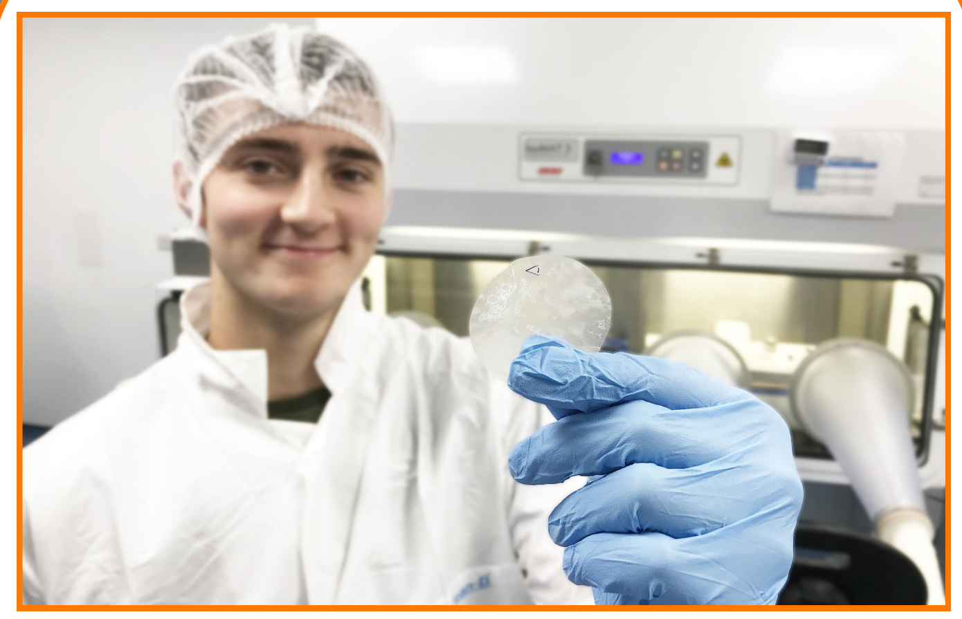
INSTILS (Inspiring Networking to Stimulate Technology Innovation in Life Sciences), Derbyshire and Nottinghamshire