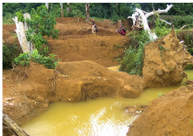
▲ Environmental degradation caused by open mining in western Côte d'Ivoire.