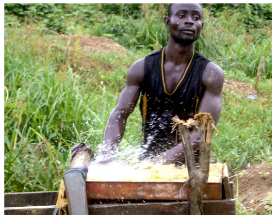
▲ Gold panning in western Côte d'Ivoire.

Prior to the Mining Code of 2014 and the implementation of the Extractive Industries Transparency Initiative (EITI), the governance