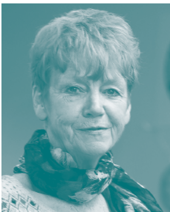
Dame Vera Baird QC Police & Crime Commissioner for Northumbria

Northumbria police and crime commissioner Vera Baird has been in post since november 2012.