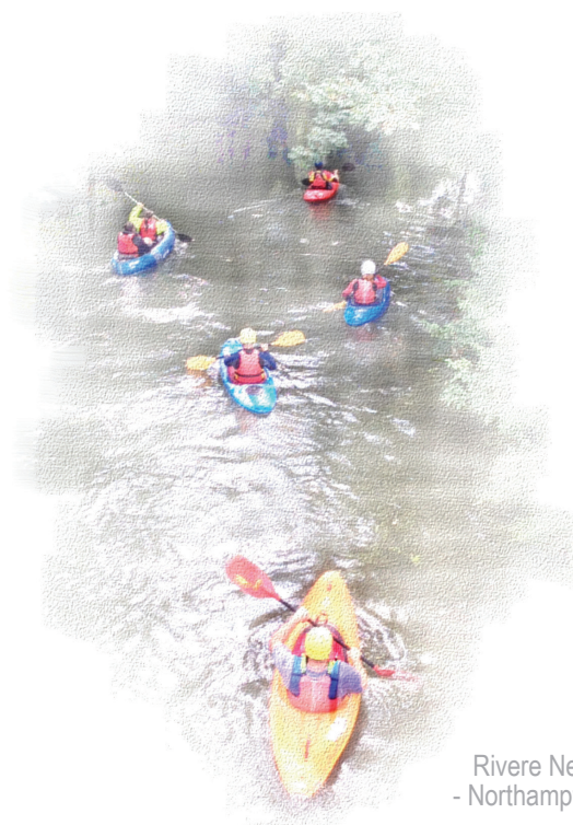
Rivere Nene - Northampton