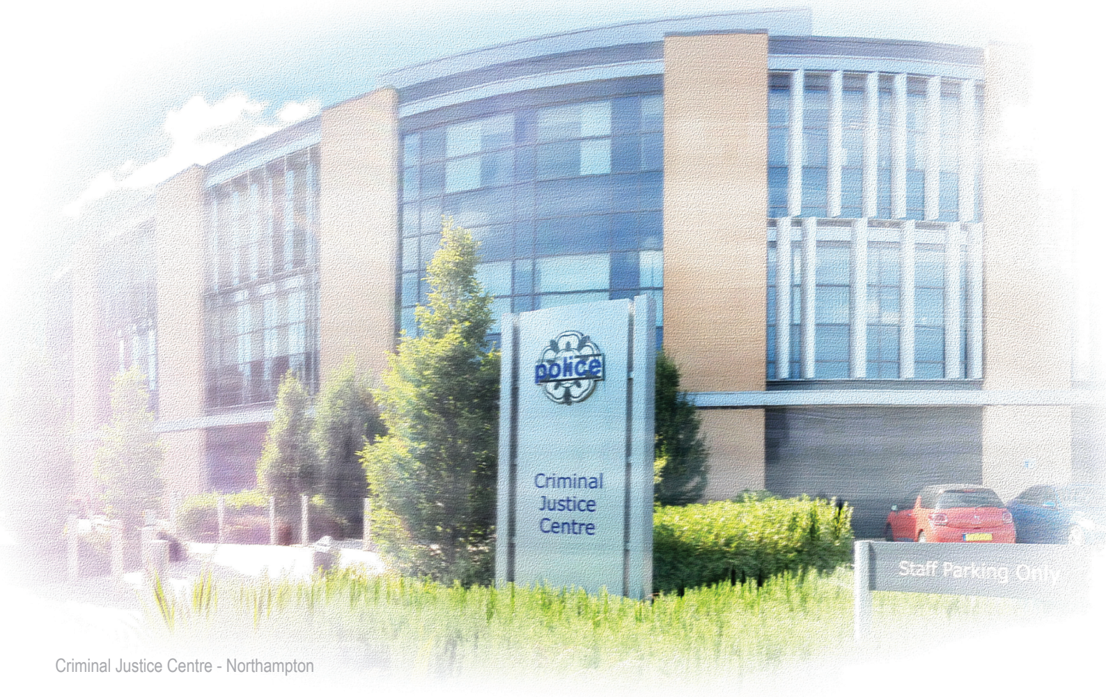
Criminal Justice Centre - Northampton