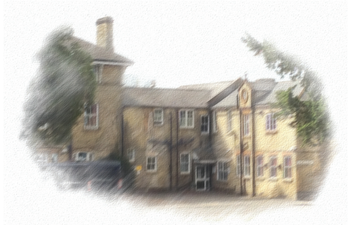
National Probation Service and BENCH - Wellingborough

We are proud to continue to play a key statutory role within MAPPA and of the significant benefits which result for our local communities through our focus on effective partnership working and high quality approaches.