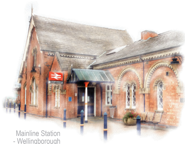
Mainline Station - Wellingborough