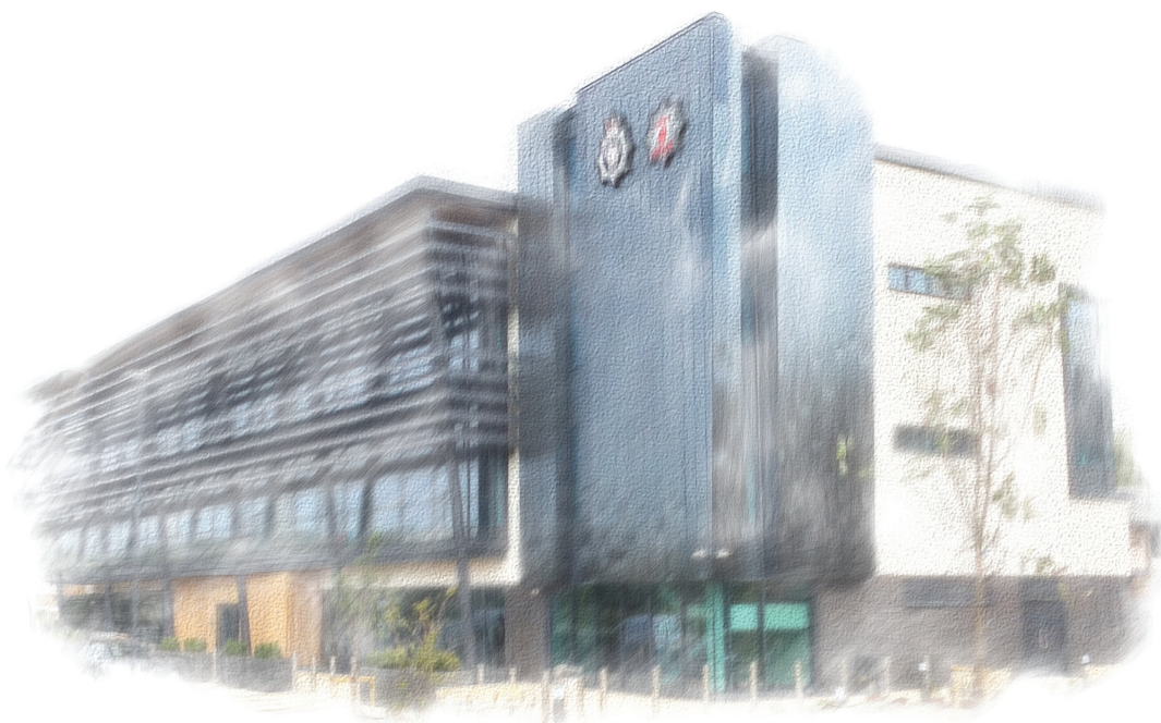
New joint-headquarters for Northamptonshire Police and Northamptonshire Fire and Rescue Service - Kettering

Northants Police have continued to play an integral part in MAPPAs tactics and actions as evidenced by a recent level 3 ('critical few') case. This resulted in the deployment of regional covert Police assets, cross border liaison with surrounding Forces and victims (including target hardening being carried out on properties) and local uniform and plain clothes police resources being deployed to actively monitor behaviour and help ensure the safety of partner agency staff. When the level 3 offender was recalled to prison the comprehensive trigger plan, held within the Force Control Room by pre-briefed staff, resulted in a prompt and coordinated response and the offender was quickly arrested by a team of officers and returned to prison without incident.