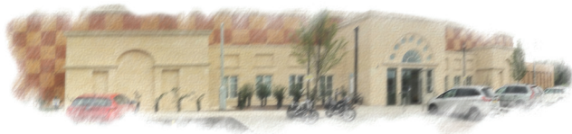
St Andrews - Northampton

Sometimes, there are patients who are serious offenders who, because of mental health diversion schemes or the nature of their route into psychiatric services, are prolific offenders, but do not have an index offence, despite having a large offending history. Again these patients can be identified at an early stage as being potential dangerous person and the Northampton MAPPA Chair can assist us to ensure that the correct MAPPA area is contacted and that meetings under the MAPPA umbrella can be convened to manage identified risks. Prior to discharge back into the community.