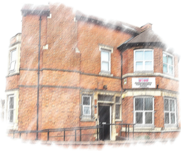
Youth Offending Service - Kettering

Very few young people meet the threshold for adoption by MAPPA. The vast majority of young people are not involved in the commission of serious sexual or violent offences. Those young people that do meet the criteria, and are adopted by MAPPA, have often experienced traumatic life events, including having been the victims of serious offences themselves, which may have had a significant impact on their behaviour. However, in such circumstances, the YOS and MAPPA work together in order to protect the public from harm, while attempting to locate and secure the appropriate resources for the young person concerned. In the case of sexual offences, for example, this may involve specific work with colleagues in Children's Social Care to locate a suitable therapeutic environment. As patterns of behaviour are less likely to be fixed in young people, this can reduce the likelihood of those young people committing sex offences in adulthood.