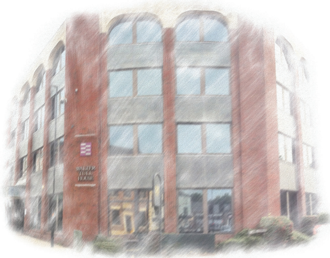
National Probation Service - Northampton

Victim safety is paramount, however restrictions placed on offenders must be proportionate to the risk they present. MAPPA seeks to balance protecting the victim and the wishes of the victim with the offender's rehabilitation.