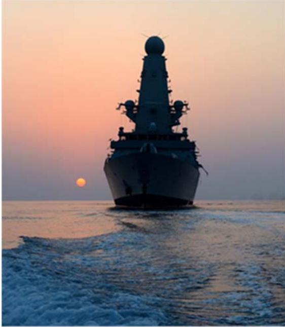
Figure 3: Type 45 destroyer HMS Dragon pictured in the Middle East during Op KIPION 2013

Due to the numbers of Royal Fleet Auxiliary (RFA) 4 personnel deployed on Op KIPION, a table has been included presenting the number of UK Entitled civilian casualties by financial year.