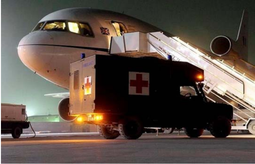
Figure 2: An Army ambulance is pictured next to a Royal Air Force Tristar aircraft at Kandahar Airfield in Afghanistan, after transporting a casualty for evacuation.

During the latest six month period 1 April 2018 to 30 September 2018 (Q1/Q2 2018/19), there were no UK Entitled civilians who sustained an injury or illness whilst on operations.