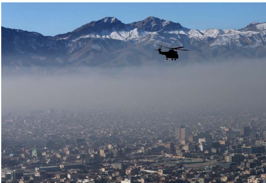
Figure 5: An RAF Puma deployed on Operation TORAL in Afghanistan

https://www.gov.uk/government/collections/op-herrick-casualty-and-fatality-tables-index (they are now located under Historical National and Official Statistics on the MOD National and Official Statistics by topic page of the website).