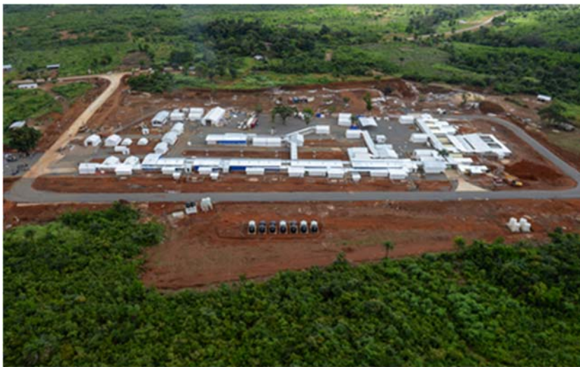
Figure 4: The Kerry Town Treatment Centre in Sierra Leone near the capital Freetown.

An Ebola treatment facility opened on the 5 November 2014 in Kerry Town, near the Sierra Leone capital Freetown. This facility was run by UK Military until 30 June 2015 when it was handed over to Aspen Medical by the deployed military team. The Kerry Town complex included an 80 bed treatment centre managed by Save the Children and a 12 bed centre staffed by UK military medics specifically for health care workers and international staff responding to the Ebola crisis. This section focuses only on those patients that were admitted to the 12 bed Health worker treatment centre run by the UK military.