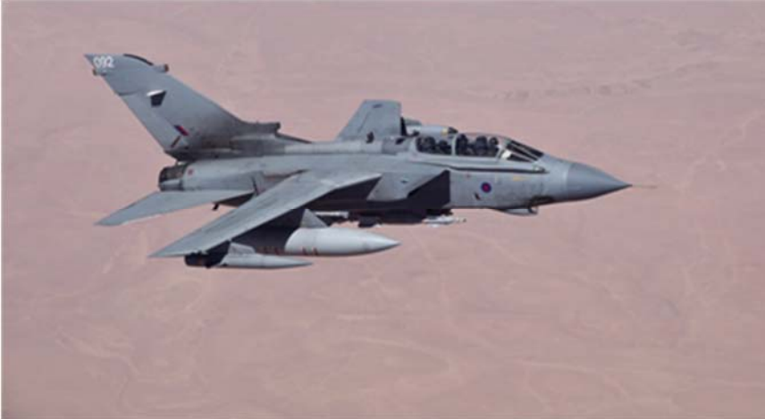
Figure 4: RAF Tornado GR4's over Iraq on an armed reconnaissance mission in support of Op SHADER.

During the latest six month period, 1 April 2018 to 30 September 2018 (Q1/Q2 2018/19), there were no UK Entitled civilians who died, sustained an injury or had an illness whilst on Op SHADER.