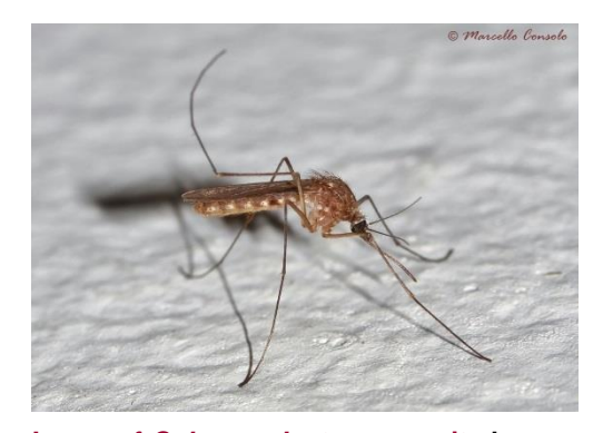
Image of Culex modestus mosquito

Cx. modestus is now known to have a widespread distribution in the Thames Estuary and along the Essex coast in coastal habitats. A joint APHA and PHE project