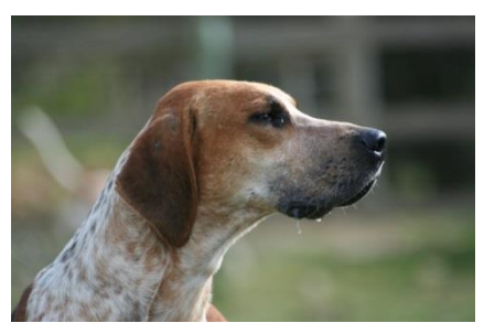
Foxhound

Mycobacterium bovis infection in non-livestock animals is a topic of regular consideration for the HAIRS group. Since the outbreak of M. bovis infection in cats in Berkshire in 2012/2013 in which transmission of infection from cats to humans was recorded [1], the group is advised by members of any unusual incidents of M. bovis infection which may have public health implications.