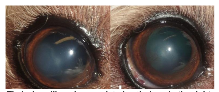
Thelazia callipaeda-associated pathology in the right eye of one of the imported UK cases (a) showing superficial ventrolateral corneal ulceration at the initial point of referral, and (b) re-epithelialisation 21 days after removal of a single male T. callipaeda .

Known as 'eye worms' because the adult worm lives in the eye and associated tissues, larvae of Thelazia species can be found in animal hosts including cattle, horses and dogs. Some species are known to infect humans. The worm is transmitted by non-