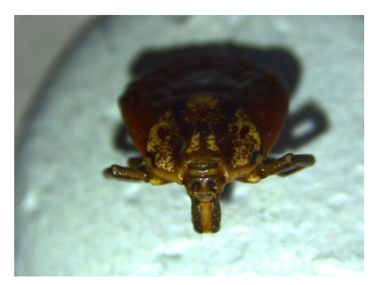
Image of female Amblyomma rotundatum tick removed from a marine toad imported from Suriname

The travel and trade of animals facilitates movement of important tick vectors globally. Such movements can introduce pathogens of medical and veterinary importance along with competent tick vectors, which may result in local disease transmission. Importation of ticks into the UK via dogs, horses, migratory birds, reptiles and even humans has been well documented, but recent evidence from Public Health England's Tick Surveillance Scheme (TSS) suggests that the number of importation events may be increasing [1].