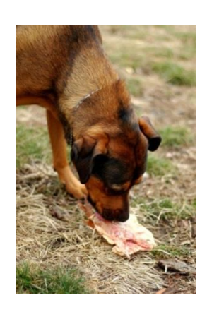
Dog eating raw meat

As this organism was not thought to be endemic in the Netherlands, alternative sources were sought, and the infection was traced to raw, frozen pet food made from imported hare meat from Argentina that had been fed to the dog.