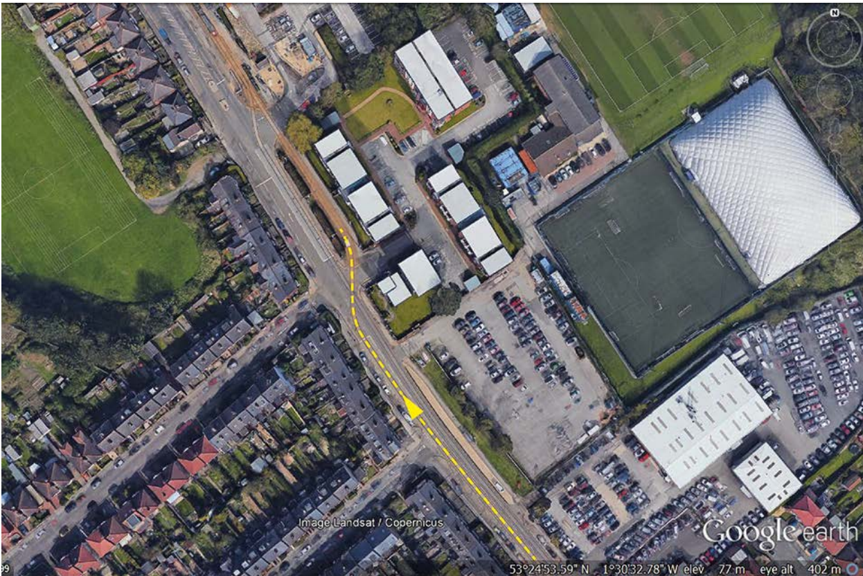
Middlewood terminus, showing the reverse curve and the direction of travel of tram 117