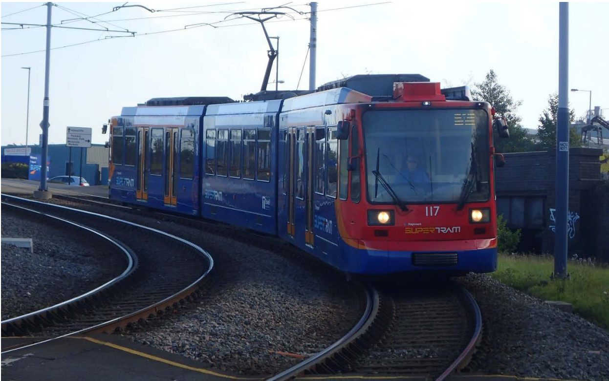
Tram 117, the tram involved in the incident. Photograph not taken at Middlewood.

The tram was to terminate at Middlewood which is approximately 2.7 miles (4.3 km) north west of Sheffield City Centre. The tramway approaching the terminus is integrated with Middlewood Road. Trams and road vehicles share the same alignment. The general speed limit on Middlewood Road, applicable to both trams and road vehicles, is 30 mph (48 km/h).