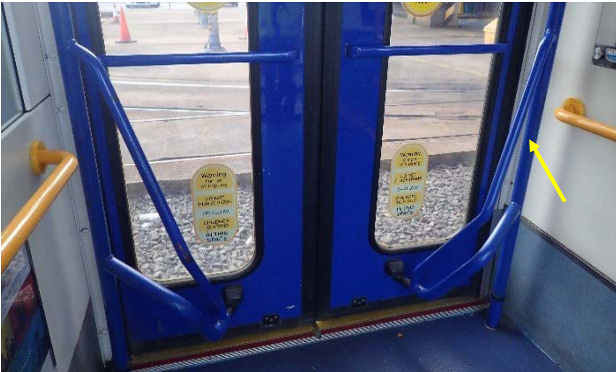
The doors on a Sheffield tram. The rotating vertical shaft is arrowed yellow