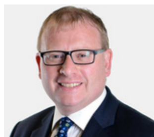
Marcus Jones MP Parliamentary Under Secretary of State (Minister for Local Government)

Every time the Government spends money or provides benefits and services, it is vulnerable to fraud and error. Estimates show the combined losses from central and local government to be between £20 billion and £49 billion every year.