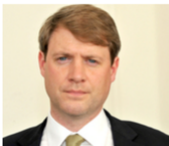
Chris Skidmore MP Parliamentary Secretary (Minister for the Constitution)