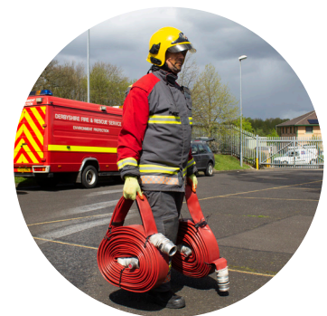
Equipment carry tests your cardiovascular fitness, muscular strength and endurance by carrying and running with a hose