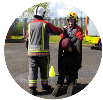
Casualty evacuation tests your lower and upper body strength and ability to walk backwards while dragging a weight of around 55kg