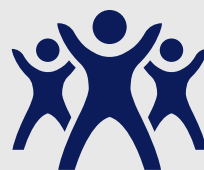
Group exercise classes