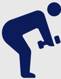
Bent over row