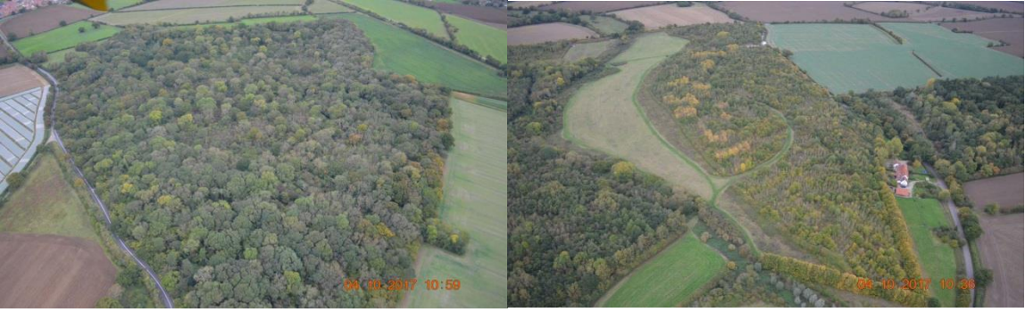
Figure 2 Aerial Survey E. Anglia 4 October 2017