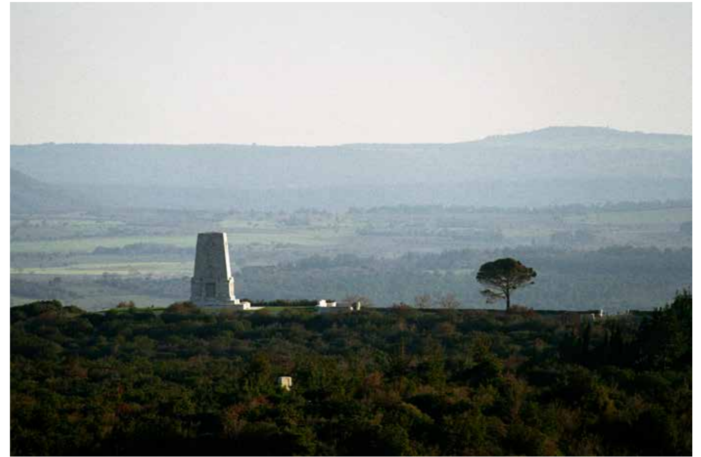
Lone Pine Cemetery.

Almost 36,000 British, Commonwealth and Irish servicemen are commemorated on the Gallipoli Peninsula. Thousands more died after being taken elsewhere for medical treatment and their graves can be found in CWGC cemeteries across the Mediterranean, including on the nearby island of Lemnos, on Malta and