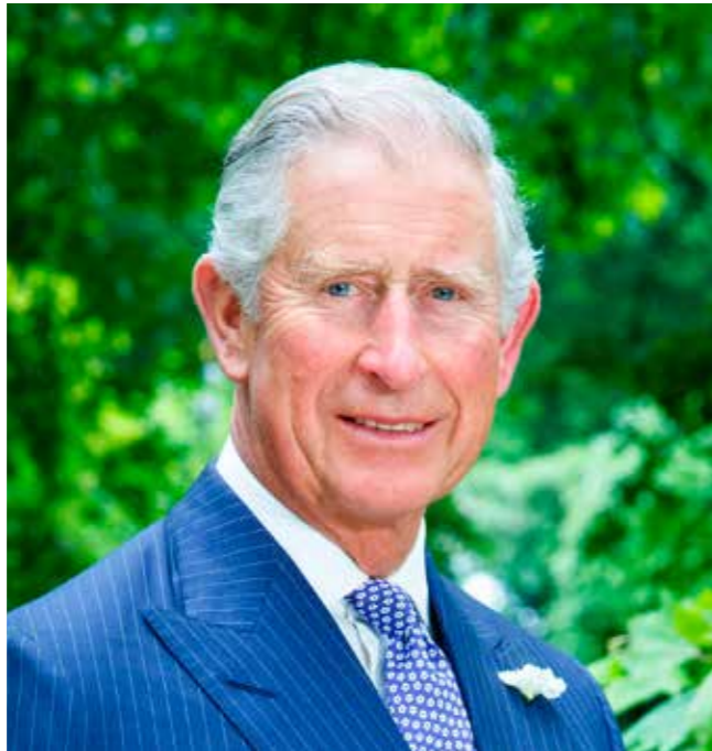
His Royal Highness The Prince of Wales