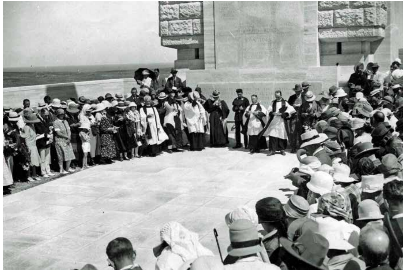
The unveiling of the Hellenic Memorial, 1924.

10,000 men, around half of those commemorated here, died during the offensive of August 1915. Several panels around the Memorial mark the contribution of the Royal Navy, while most of those sailors who lost their lives are commemorated by name in the United Kingdom, on the great naval memorials at Portsmouth, Plymouth and Chatham.