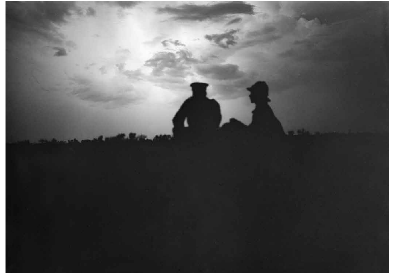
The Gallipoli night sky lit up by the fire of the guns and star shells. © Imperial War Museums (Q 13332)

From 'W' Beach by Geoffrey Dearmer, W. Heinemann, 1918