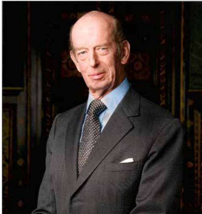
His Royal Highness The Duke of Kent, President of the Commonwealth War Graves Commission