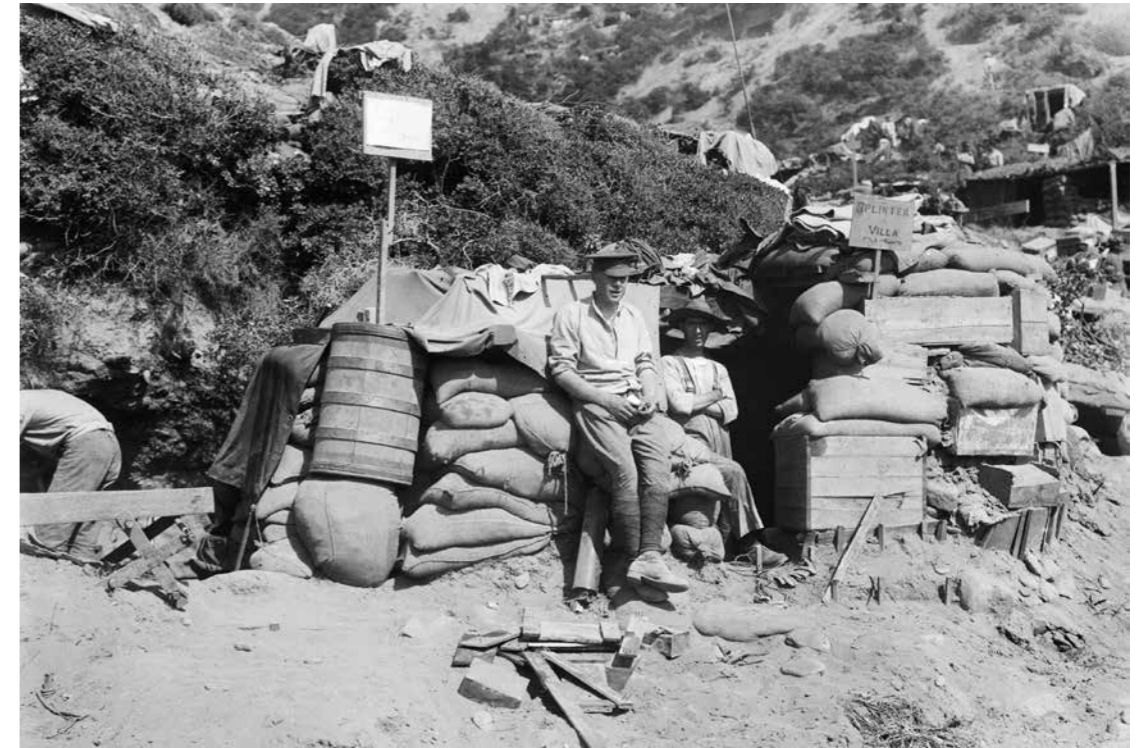
Periscope supply depot dug-out 'Splinter Villa', home to two Australians on the Anzac Beach. © Imperial War Museums (Q 13797)

Empire. In England, Scotland, Wales and Ireland communities marked those dates on which their local men had been lost, anniversaries which often became known as 'Gallipoli Day'. After the end of the war, the Battle of Çanakkale would have an important legacy in the newly formed state of Turkey led by Mustafa Kemal (later known as Atatürk). Today, the dates of significant victories over the Allies are marked by the Turkish people on 18 March and 10 August.