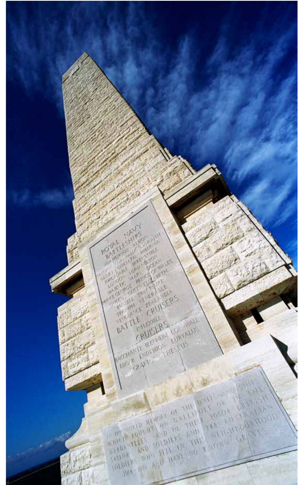
The Helles Memorial.

The Memorial also bears the names of nearly 21,000 servicemen with no known grave. The majority served with British and Irish regiments, but among them are over 1,500 who served with the Indian Army and 249 who served with Australian forces and died in the Helles sector. Some