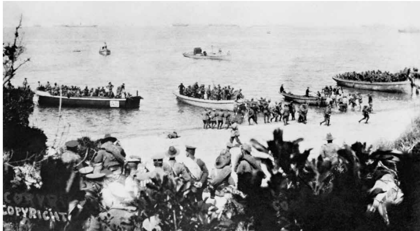
Australians landing at Anzac Cove at 8am, on 25 April 1915; part of the 4th Battalion and the mules for the 26th (Jacob's) Indian Mountain Battery. © Imperial War Museums (Q112876)

fought their way ashore under fire and it became known by the British as 'Lancashire Landing'. At V Beach, relentless gunfire from the surrounding cliffs devastated the Dublin Fusiliers approaching in rowing boats and the Munster Fusiliers, who attacked from the converted collier River Clyde , run aground close to the beach. Only after dark could progress be made and the wounded recovered. While the other Helles landings, at S, X and Y Beaches, met lighter resistance, the difficult landscape and communication problems, as well as Ottoman counter-attacks,