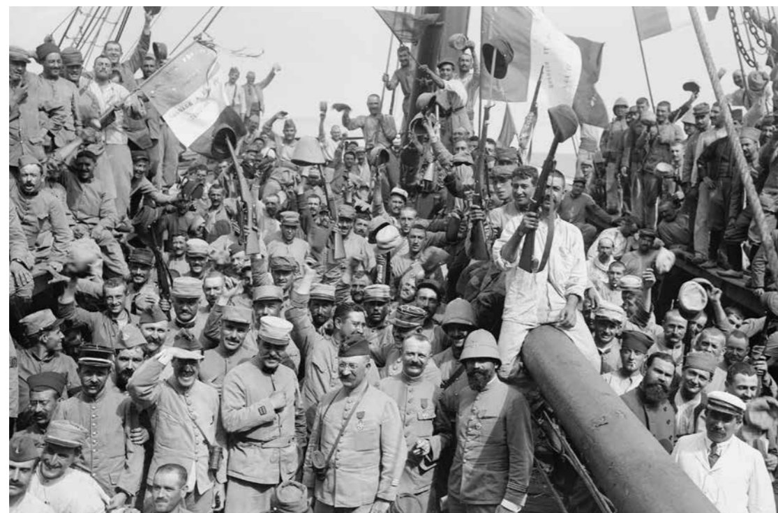
French troops en route to Gallipoli. © Imperial War Museums (Q 13411)

Beginning on the night of 6 August, the Suvla landings had been intended to quickly secure the weakly defended high ground surrounding the bay, but confusion and indecision caused fatal delays. Soon, Ottoman reinforcements had taken up strong positions inland and the opportunity to advance was lost. The final offensives of the summer began on 21 August, with brutal fighting on Scimitar Hill and Hill 60, to the north of Anzac Cove. Although a link between the Suvla and Anzac sectors was secured, thousands more casualties were suffered and Ottoman resistance remained resolute.