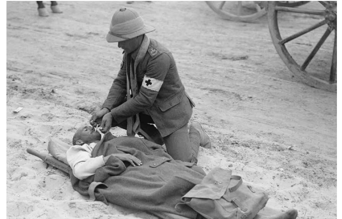
A stretcher bearer of the Royal Army Medical Corps, 42nd (East Lancashire) Division, lighting a cigarette for a wounded soldier.

Soon afterwards, the Ottomans mounted major counter-attacks in an attempt to dislodge the Allies across the peninsula, suffering heavy losses of their own. On 19 May, some 10,000 Ottoman soldiers were killed or wounded during a failed offensive in the Anzac sector. A formal ceasefire was arranged and on the morning of 24 May the guns fell silent for several hours, as men of both sides buried their dead under grey skies and falling rain.