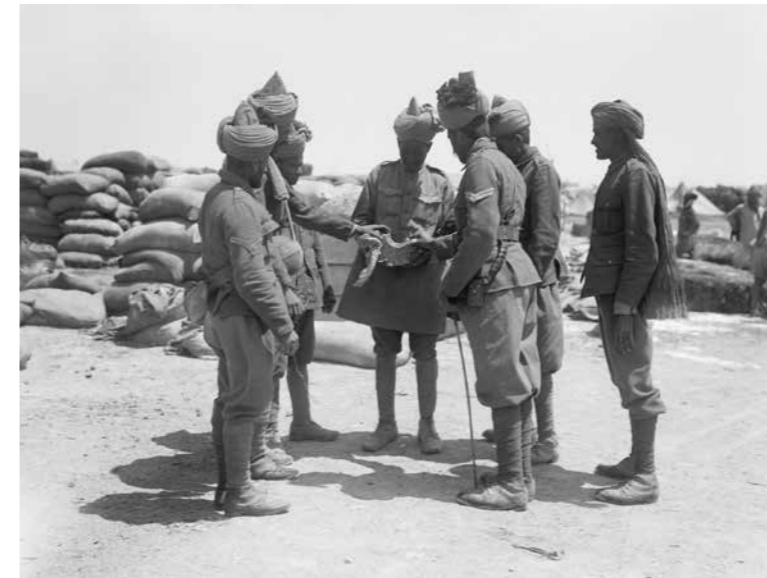
Men of the 14th Sikhs of the 29th Indian Infantry Brigade examining a piece of shell from 'Asiatic Annie' that fell in their camp. © Imperial War Museums (Q 13372)

A renewed Allied offensive began in August 1915. With Ottoman forces