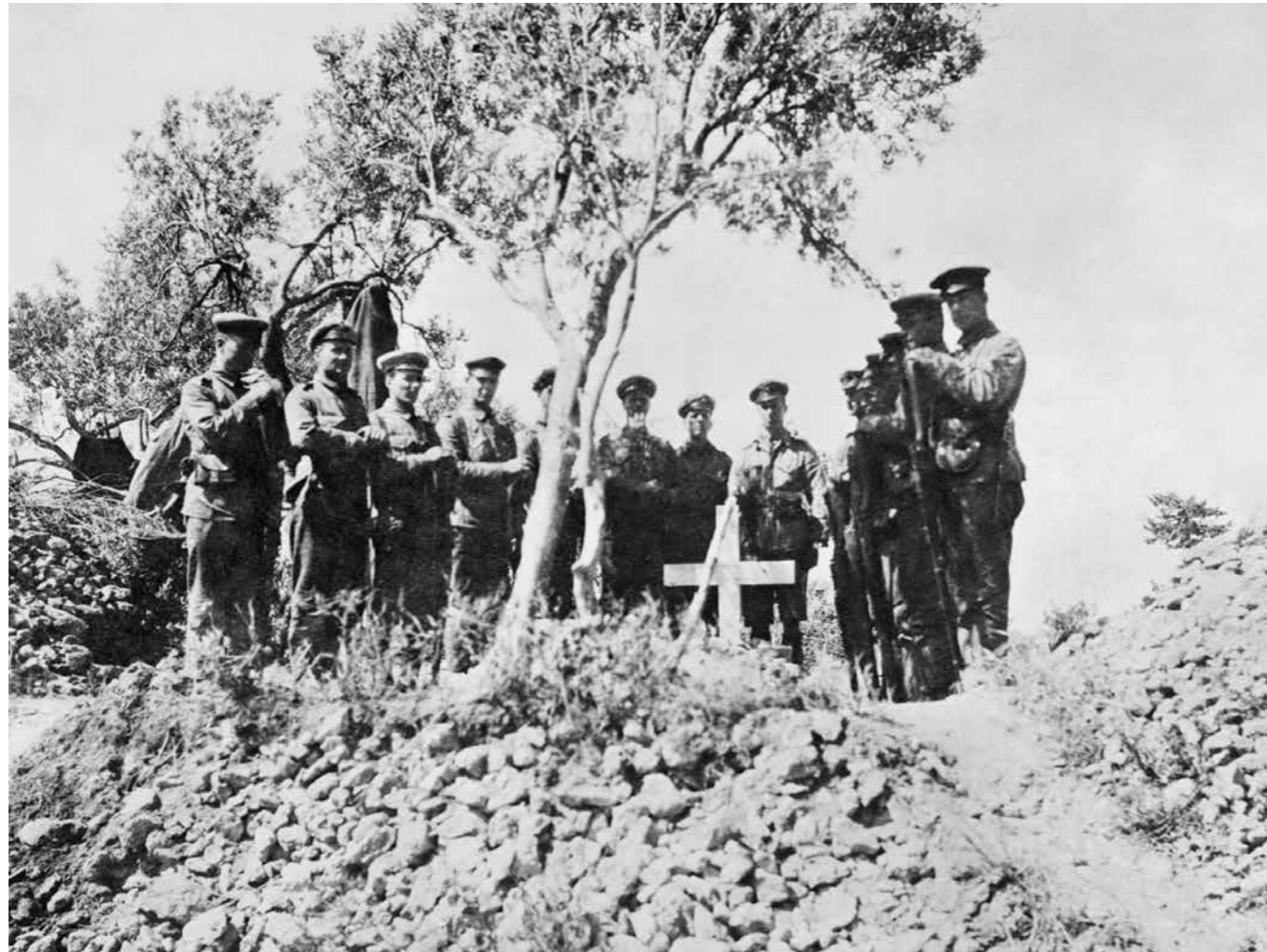
Royal Naval Armoured Car Division burial party, Cape Helles, 1915. © Imperial War Museums (Q 502170)