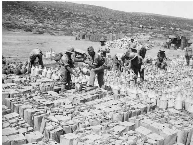
Filtering water before it is put into covered cans. © Imperial War Museums (Q 13448)