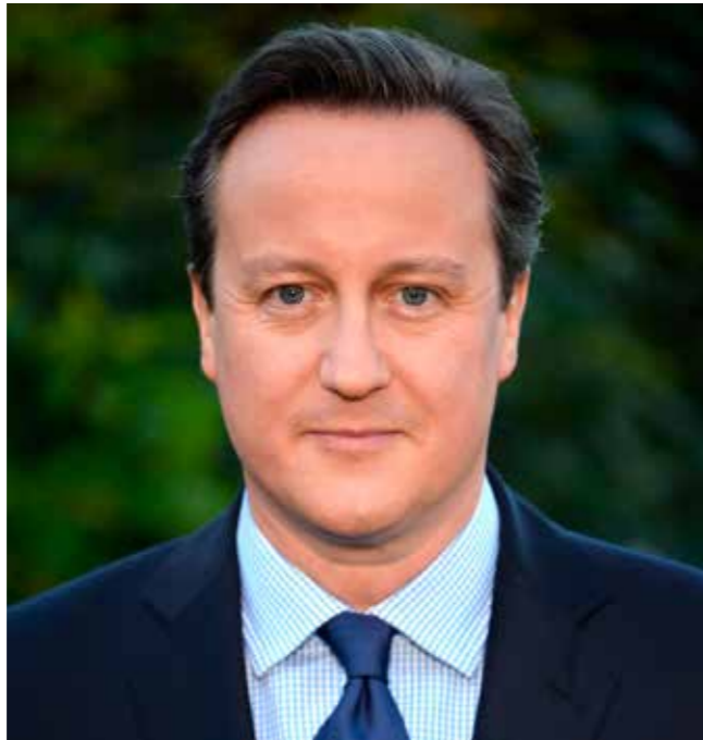
The Right Honourable David Cameron, Prime Minister of the United Kingdom of Great Britain and Northern Ireland