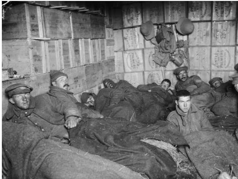
Frost-bitten soldiers lying on straw in shelters constructed of biscuit boxes, at a store dump at Suvla, after the frost at the end of November 1915.