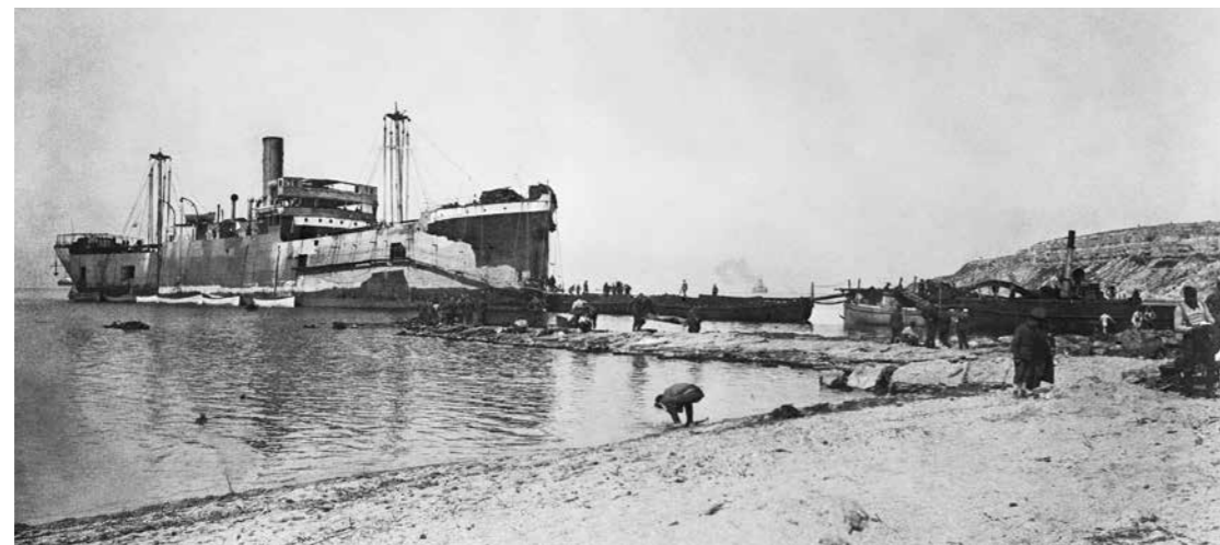
The converted collier River Clyde , run aground at V Beach after the allied landings at Gallipoli, spring 1915.

When the exhausted Allies made their first attempt to break through Ottoman lines in Helles three days later, they suffered several thousand casualties.