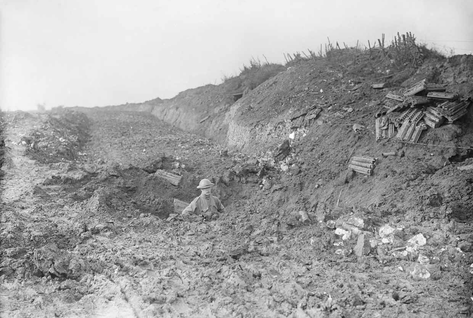
Shell hole on a sunken road near Contalmaison, September 1916

the high ground known as Bazentin Ridge, the 38th (Welsh) Division began a series of attacks to drive German forces from their strong concealed positions in Mametz Wood, a struggle which continued for several days.