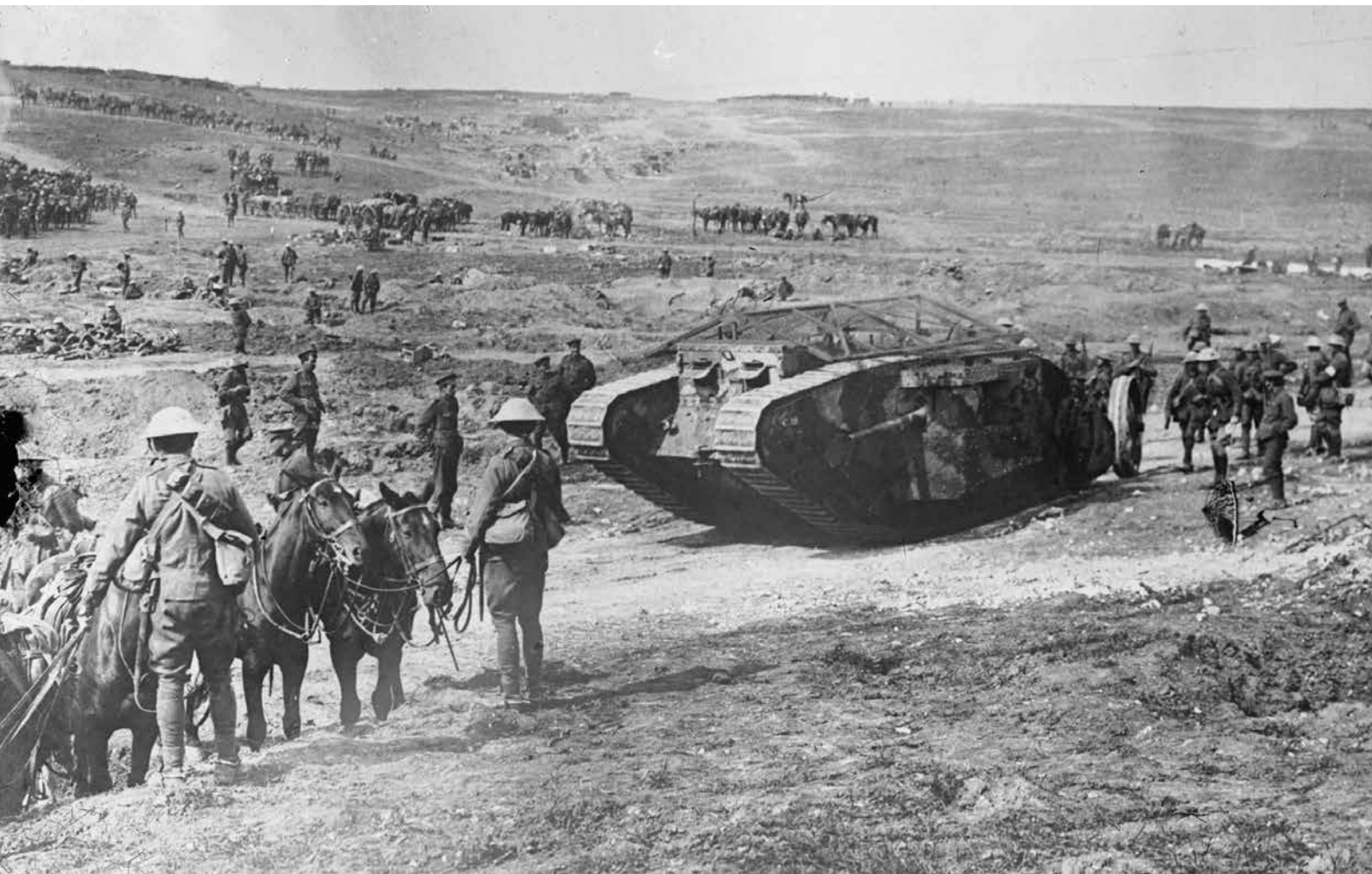
A Mark 1 tank at the Battle of Flers–Courcellette, the first time tanks were used in action

In mid-September, with French reinforcements arriving from Verdun, the Allies attempted a renewed and co-ordinated offensive. The British Army would attack across a wide front, from Mouquet Farm to Morval, towards the villages of Courcellette and Flers, while the French Sixth Army would strike to the east of Combles. Artillery bombarded German lines for three days until 6.20am on 15 September, when the advance began in the morning mist and smoke. A new invention was used by the British for the first time: 49 Mark 1 'tanks'. Moving at no more than four miles an hour, they proved mechanically unreliable, and most broke down or foundered in the mud. But some managed to break into German lines and helped the infantrymen to capture enemy defences, terrifying German soldiers.