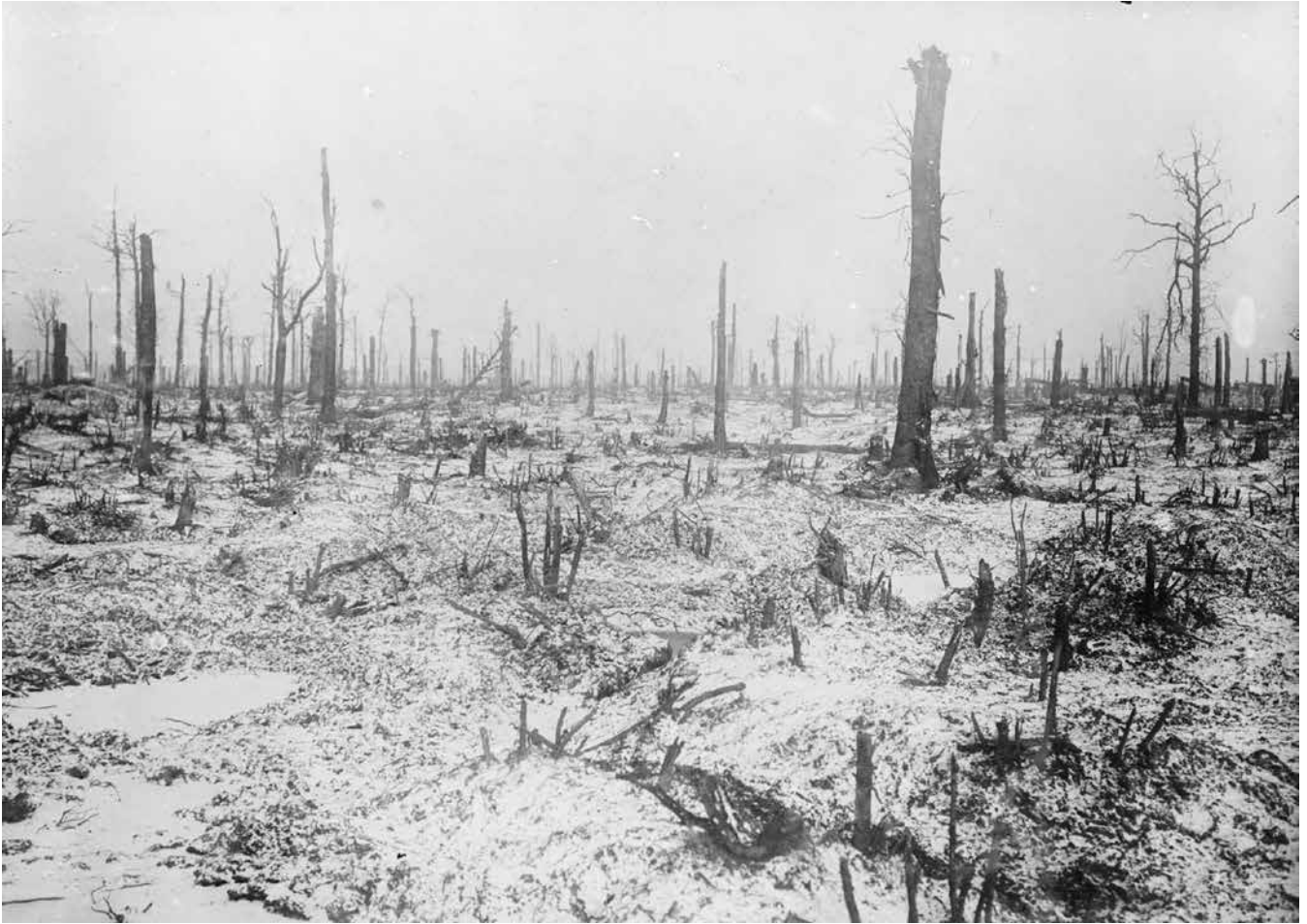
Trônes Wood after a snowstorm, November 1916

towards a 60-foot high mound called the Butte de Warlencourt. By now the battlefield was a quagmire, and guns became so clogged with mud that soldiers relied on bomb and bayonet.