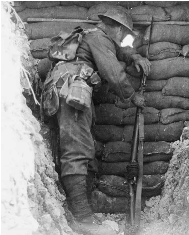
Sentry of the Worcestershire Regiment looking through a loop- hole in a trench at Ovillers, August 1916

In the south, the 21st Division and a brigade of the 17th (Northern) Division advanced around the village of Fricourt, while the 7th Division entered Mametz and captured the high ground above it. The 18th Division attacked from shallow tunnels dug to within 20 yards of the German lines, and reached its objectives on the high ground above Montauban by mid-afternoon. Supported by French artillery, the 30th Division – including Pals' Battalions from Liverpool and Manchester – captured the village itself and joined up with the French forces to their right.