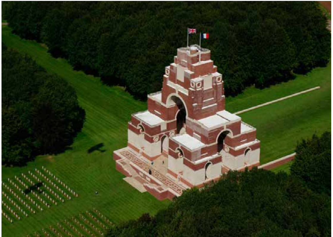
The Thiepval Memorial

Early plans envisaged many more memorials to the missing than were eventually constructed, as well as separate 'Battle Monuments' marking key moments in the British Army's war. French advice as well as logistical restraints reduced the quantity of monuments, if not their scale, as well as making the memorials to the missing perform the function of marking battles as well as bearing names. While South Africa decided to commemorate the names of its missing at Thiepval, other governments listed their Somme missing elsewhere: Australia at Villers-Bretonneux, Canada at Vimy, India at Neuve Chapelle, Newfoundland at