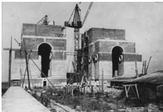
The Thiepval Memorial under construction

French and British military bands were conducted by the celebrated conductor Adrian Boult, then director of music at the BBC, which broadcast the service in the UK and across the Empire.