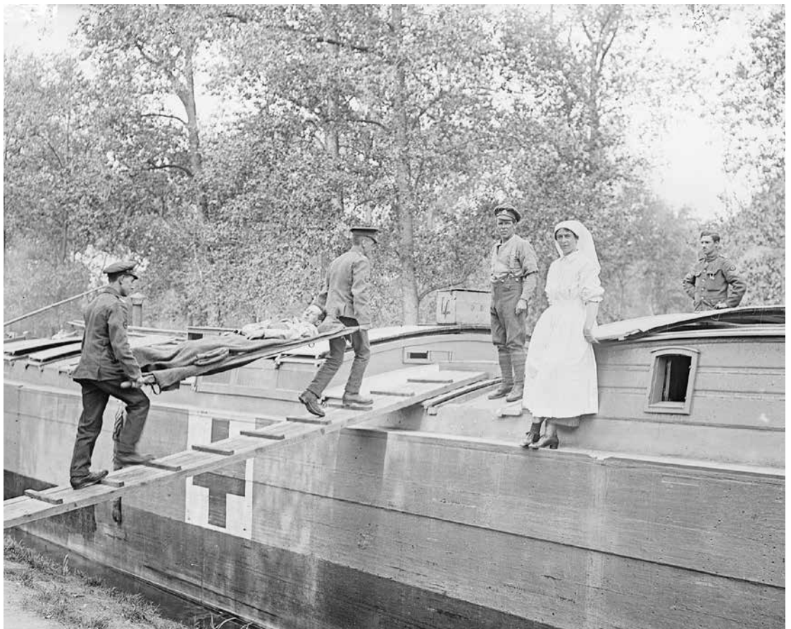
Royal Army Medical Corps (RAMC) troops carrying the wounded on to a hospital barge at Vaux-sur-Somme, 25 August 1916