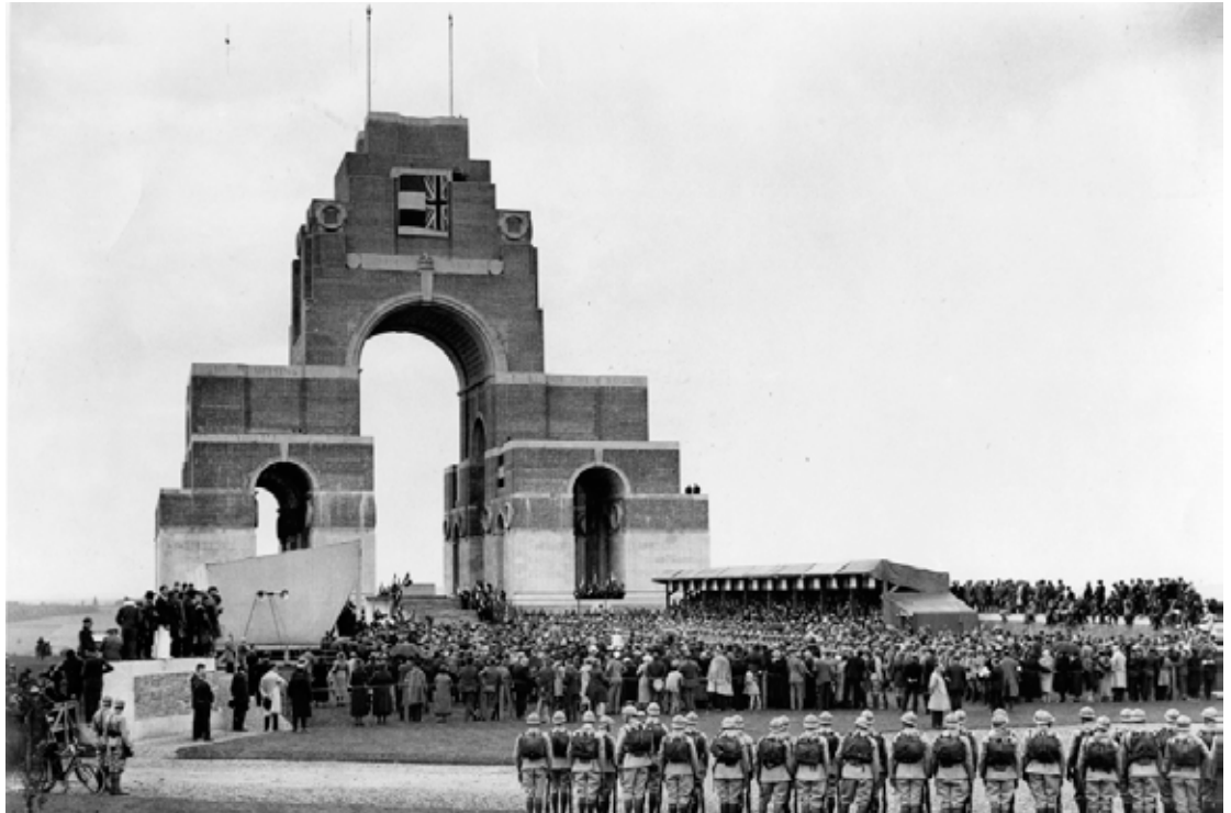
The unveiling ceremony of the Thiepval Memorial, 1932

In 2015, a major project was announced to perform further conservation work, funded by the UK Government and the CWGC. In advance of the centenary commemorations, substantial repointing took place across the brickwork on the upper tiers of the memorial. Renovation of the roof ensured that significant flaws were addressed. New lighting illuminated the memorial for the first time on the night of 30 June 2016. A second phase of work, scheduled to take place after July 2016, will address the internal drainage, which has been the chief cause of structural problems since construction. By completion, the project aims to ensure that the great memorial continues to stand sentinel over the Somme for another century.