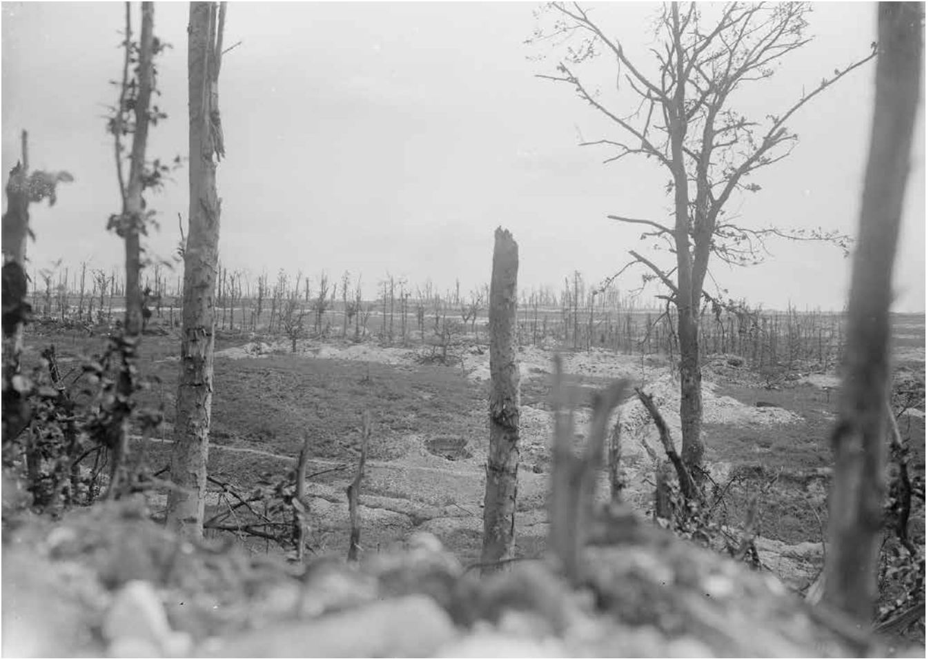
The ruined village of Thiepval, from Thiepval Wood