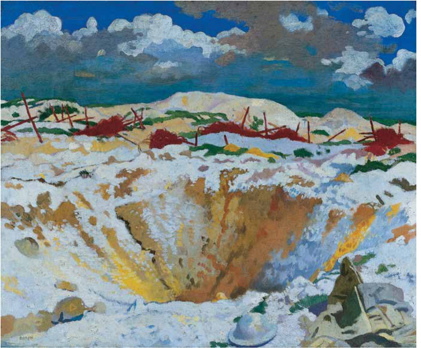
German Wire, Thiepval, William Orpen, 1917