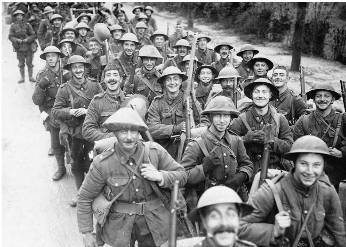
The 10th Battalion, Royal Fusiliers (37th Division), known as the Stockbrokers' Battalion, marching to the trenches

had sanctioned the creation of battalions formed of men from the same communities, clubs, schools, and workplaces. Within two months of the outbreak of war, over 50 towns had mustered what the Earl of Derby termed 'a battalion of pals'.