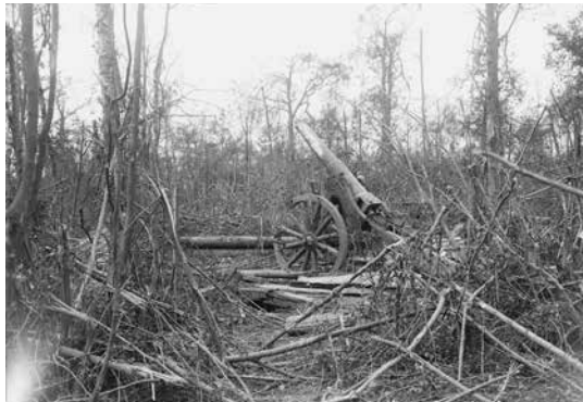
A captured German gun in Mametz Wood, 10 August 1916 © IWM Q 1040

positions before lifting, and some 22,000 British soldiers – including New Army volunteers – attacked through the mist. Aided by the element of surprise, they quickly overran the German positions and moved into the village of Longueval. Advance parties found High Wood abandoned, but by the time elements of the 2nd Indian Cavalry Division were brought up and charged across the battlefield in the early evening, German forces had returned. More than 9,000 men were killed, wounded or captured in taking Bazentin Ridge, but the following days and weeks would develop into an attritional struggle.