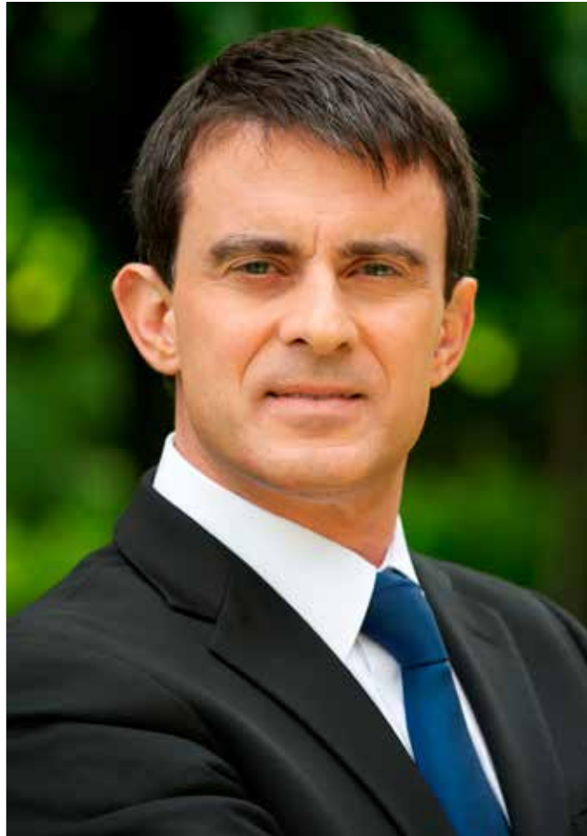
M. Manuel Valls, Prime Minister of the French Republic