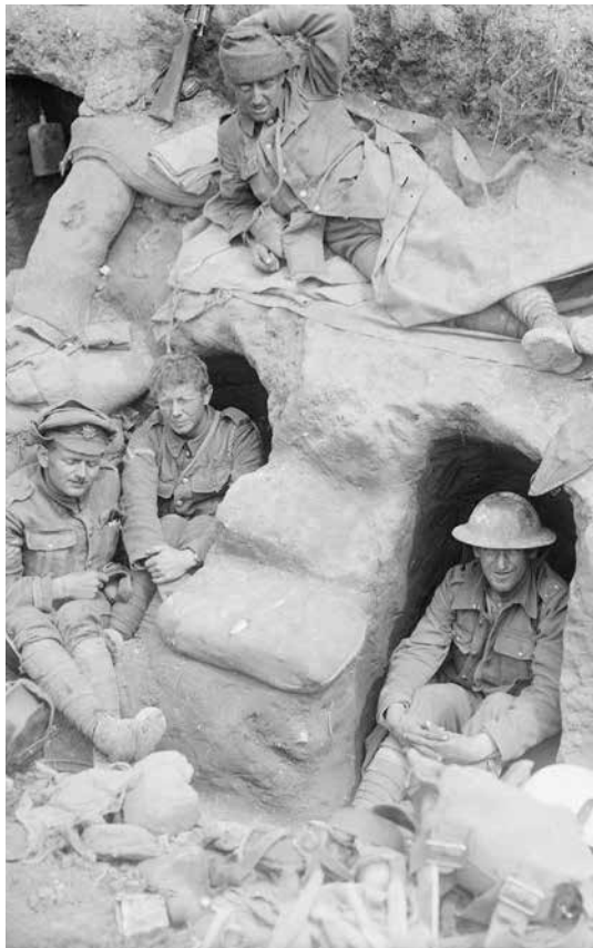
Men of the 8th Battalion, the Border Regiment, resting in a captured German trench near Thiepval Wood, c. 3 July 1916

Thiepval itself had been transformed into one of the formidable positions on the Somme, and was the objective of the 32nd Division. 'So intense and accurate was the machine-gun fire that whole lines of men were swept down dead or wounded,' stated the official British historian. 'It was said, with some truth, that only bullet-proof soldiers could have taken Thiepval on this day.'