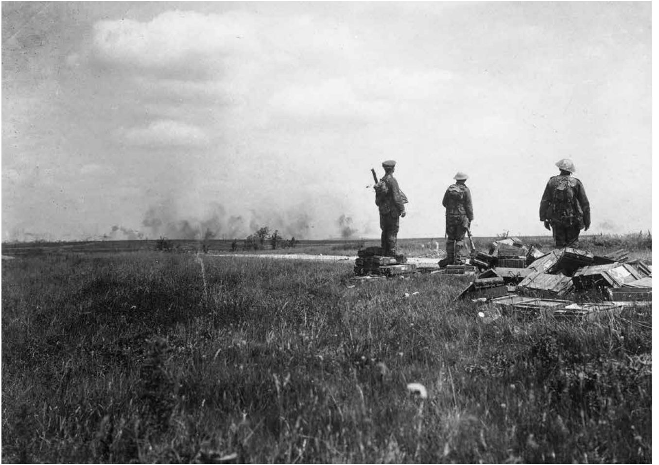
Opposite: Poilu and Tommy , William Orpen, 1917 © IWM (Art.IWM ART 2959