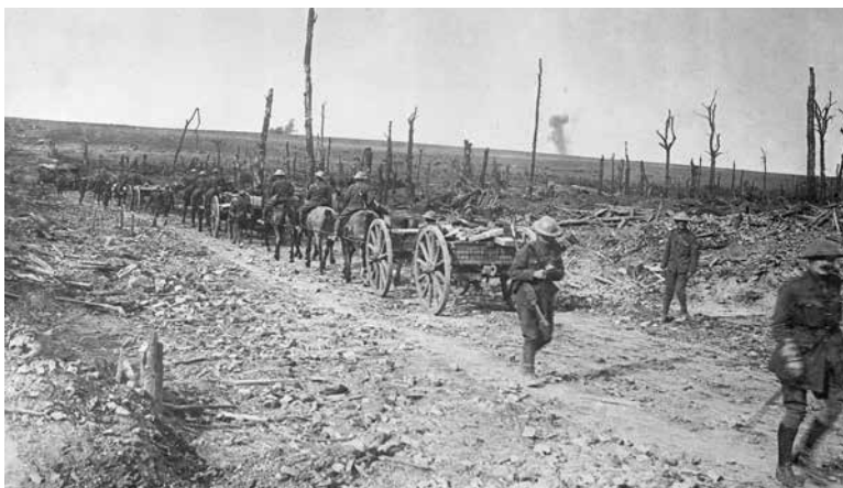
The 35th Field Battery, Royal Field Artillery, passing through the devastated Delville Wood, September 1916 © IWM Q1211

The German defences around the village of Pozières formed a key position along the ridge which ran north-west towards Thiepval. At 12.30am on 23 July, after an intense 'hurricane' bombardment, men of the Australian Imperial Force, supported by British troops, advanced towards the village. They faced intense artillery fire and ferocious counter-attacks over the following days, until the crest of the ridge was finally taken on 6 August. Australian troops had taken part in a disastrous diversionary attack at Fromelles on 19 July, but this was the first deployment of Australians on the Somme, and many were veterans of the fighting at Gallipoli.