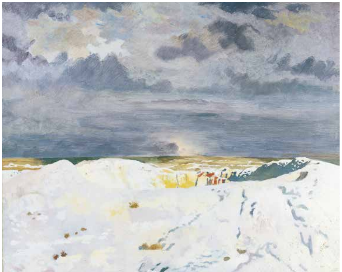
The Great Mine, La Boiselle, William Orpen © IWM (Art.IWM ART 2379)

The men of 31st Division had arrived in crowded, waterlogged trenches near the German-held village of Serre in the early