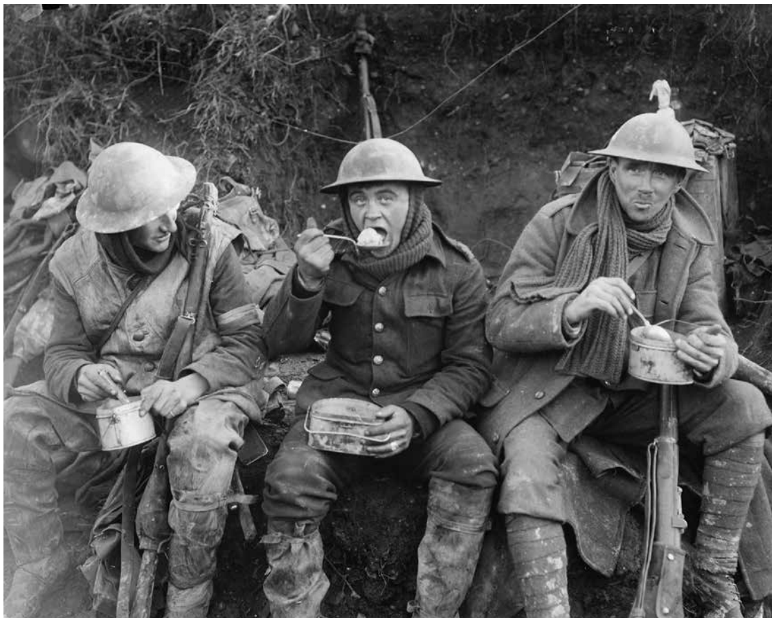
British soldiers eating hot rations in the Ancre valley, October 1916

In October, as autumn turned into winter, the French Army continued to drive east, taking the village of Sailly-Saillisel. The British Reserve Army – soon to be renamed Fifth Army – fought at the Schwaben Redoubt and the high ground above the Ancre, while the Fourth Army continued its push towards the Transloy Ridge. Progress was slow and costly in the rain and mud, through Eaucourt l'Abbaye and Le Sars, and