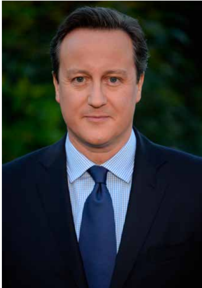
The Right Honourable David Cameron MP The Prime Minister of the United Kingdom of Great Britain and Northern Ireland