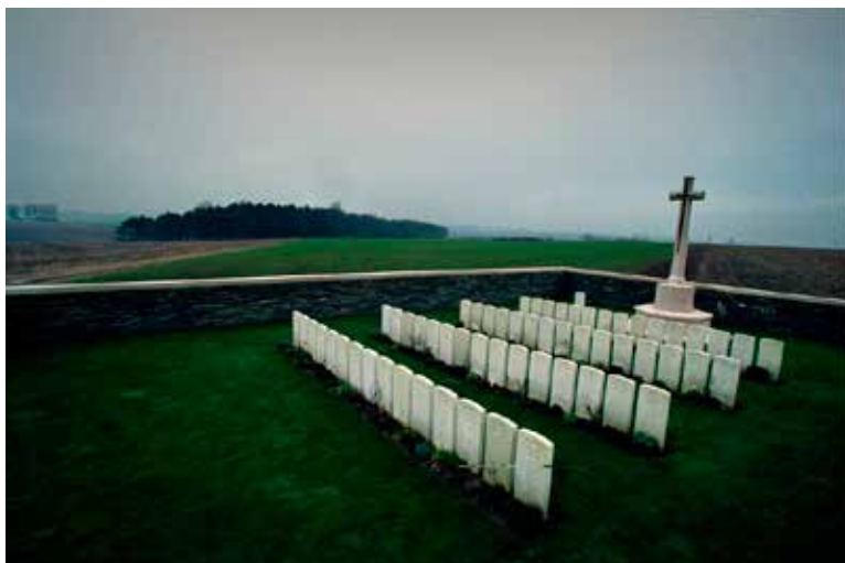
Serre Road Cemetery No.3

Much of the clearance work in the northern part of the battlefield was conducted by V Corps in the spring of