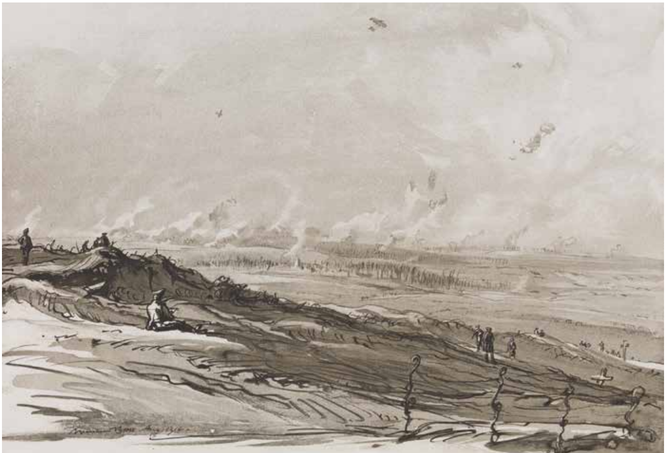
The Battle of the Somme, 1916, Muirhead Bone, 1918

Many men returned home with physical or psychological wounds which never healed. Even those who survived unscathed would carry their experiences for the rest of their lives. The names of rivers, villages, farms and woods previously unknown would become seared into the memories of individuals and communities across Britain and its Empire: Serre, Beaumont-Hamel, Ancre, Mametz, Longueval, Delville Wood, Pozières, Guillemont, Courcelette, Thiepval. For Britain, the Battle of the Somme would remain the longest and most costly battle of the war.