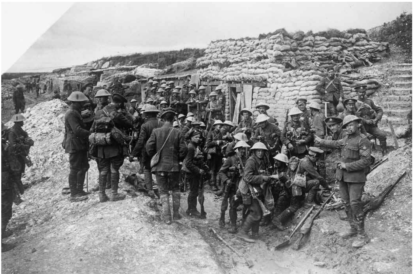
Soldiers of the 16th Battalion, the Middlesex Regiment (29th Division), near Hawthorn Ridge, 1 July 1916

From trenches alongside Thiepval Wood, the men of the 36th (Ulster) Division swept from no-man's land across the Schwaben Redoubt, making some of the furthest advances of any British troops. Yet with little support, they were gradually pushed back by German reinforcements, leaving hundreds of dead and wounded behind.