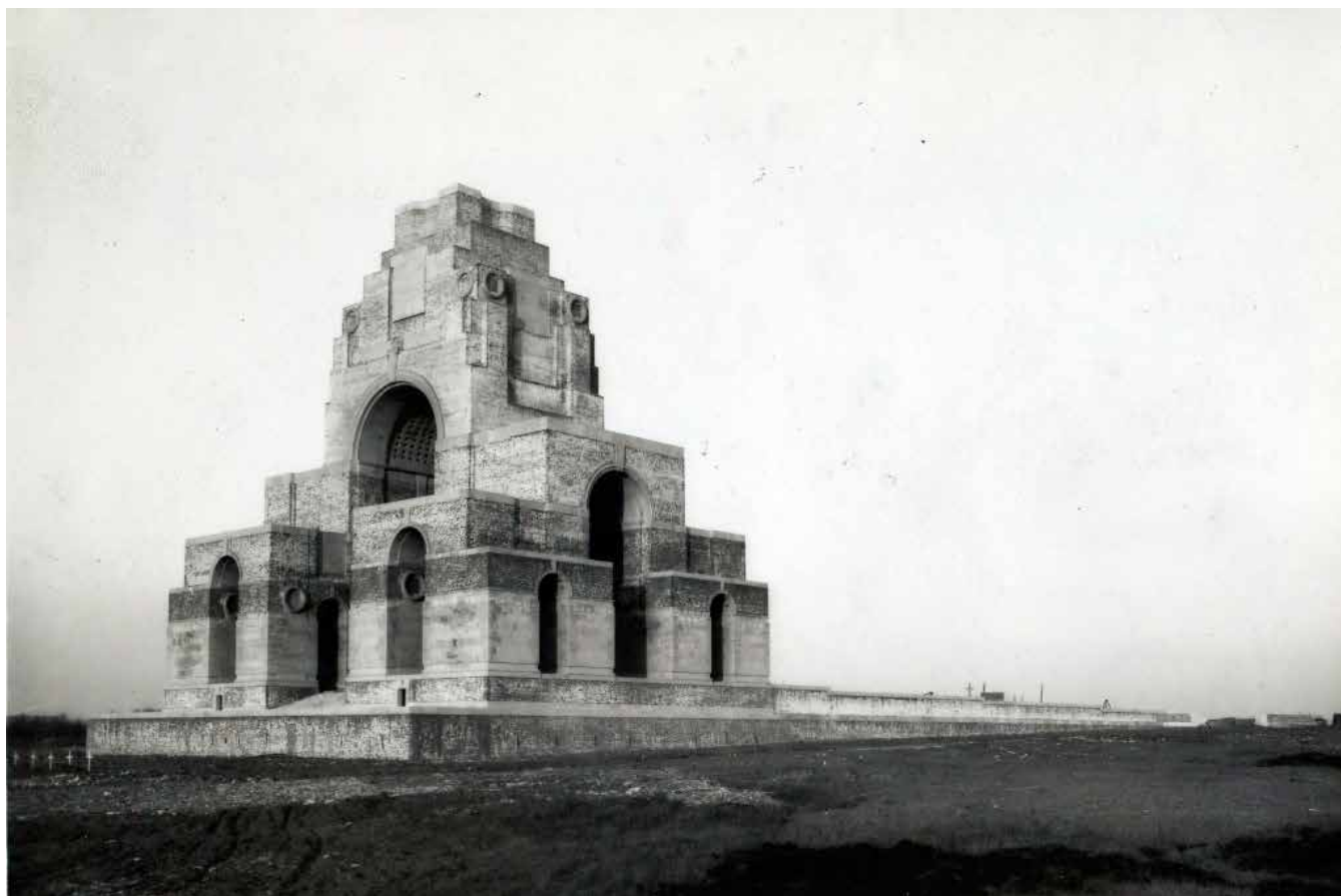
The Thiepval Memorial, 1932

Commission and the driving force behind its creation, and Sir Edwin Lutyens. Among the veterans in attendance were several who were employed by the Commission as gardeners, remaining in France to tend the graves of their fallen comrades.