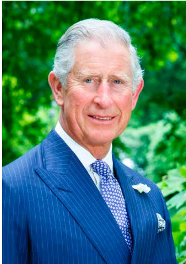
His Royal Highness The Prince of Wales