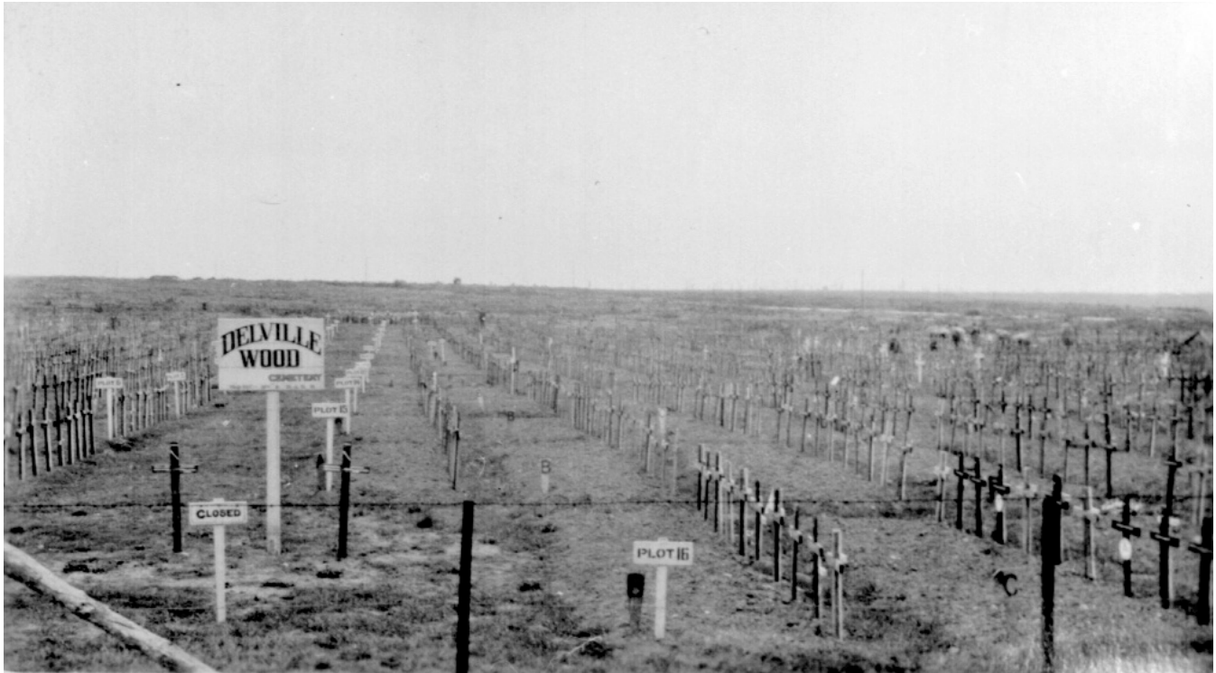
Delville Wood Cemetery

1917. Here, the front line moved little during the battle, and today a series of small cemeteries lie along it, near Serre and along Redan Ridge, where once lay British and German trenches. The dates 1 July and 13 November appear frequently among the headstones. Many bear no names, the remains they mark having lain in no-man's land for months. The great 'concentration' cemeteries were built around existing cemeteries, others on entirely new sites. Many lie in the most fought-over areas of the battlefield and mark significant moments in the battle. The largest is called Serre Road Cemetery No. 2. Begun in the spring of 1917 but not completed until 1934, it is the final resting place of more than 7,000 soldiers, of whom some 5,000 remain unidentified.