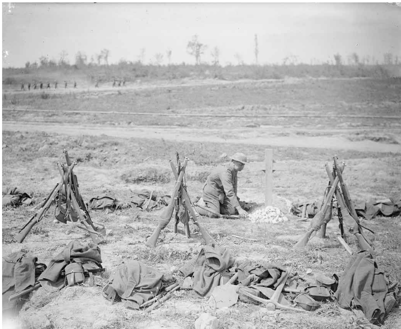
A man of a working party attending to a war grave, August 1916