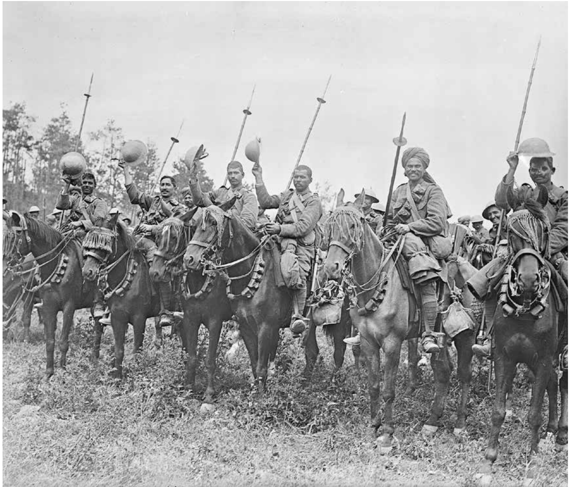
The 20th Deccan Horse, Indian Army, shortly before their attack at High Wood, 14 July 1916

were subjected to intense shelling, machine-gun fire, sniping and hand-to-hand combat with bomb and bayonet, day and night, until they were relieved on 20 July. By this time the Brigade had lost more than 2,300 men killed, wounded or missing. The struggle for Delville Wood, and similarly brutal fighting at High Wood to the west, would continue for weeks.