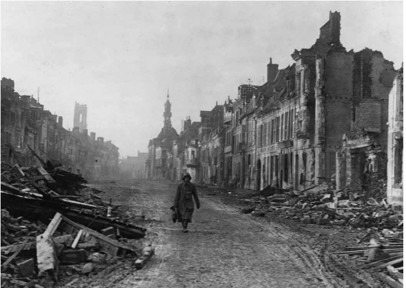
German soldier in the shell-ruined and deserted Péronne, 1916