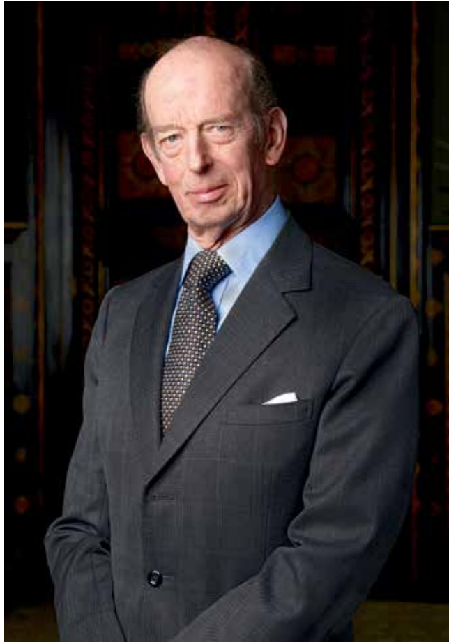
His Royal Highness The Duke of Kent President of the Commonwealth War Graves Commission