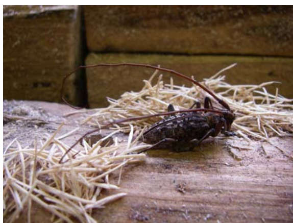
Photo: Emerging Monochamus Beetle

Finding these two species together is significant because the beetle is an agent for spreading, or a vector for, the nematode. The inadvertent importation and subsequent escape of these pests is thought to have been responsible for numerous outbreaks of pine wilt disease which have killed millions of trees around the world. Within the EU an outbreak of Pine Wood Nematode was first discovered in Portugal in 1999 where eradication efforts have failed and the pest has now spread widely within the country with small outbreaks being recorded across the border into Spain in recent years.