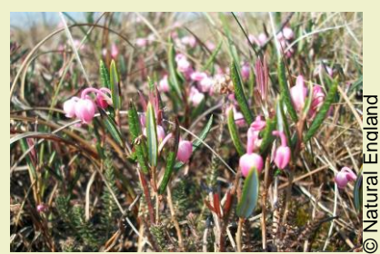
Bog Rosemary with its pink, bell shaped flowers, is a relative of Heather and a bog specialist.