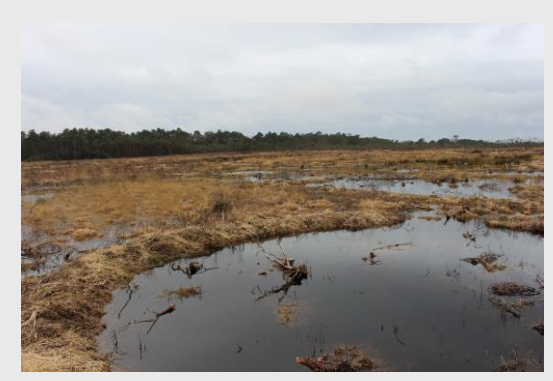
Bunding work holding a skim of water on the bog surface