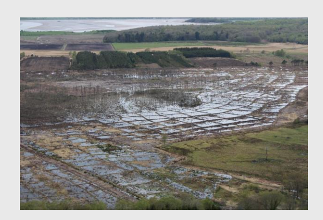
View from Ellerside Hill showing how the filled in drains and the bunding is helping to restore the watertable on the bog.