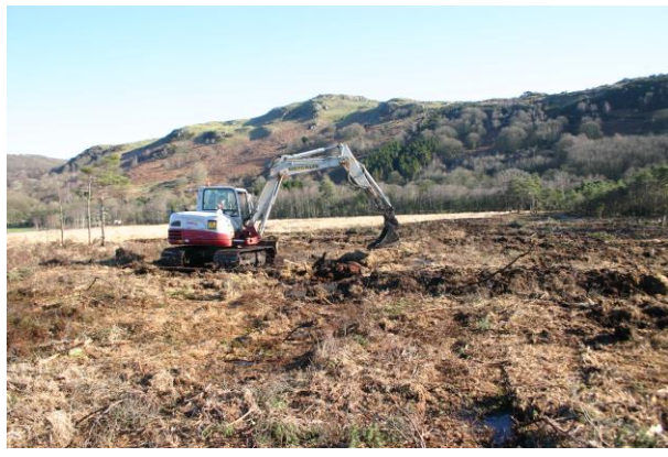
Groundworks taking place on dry, degraded bog. All photos on this page © Natural England

Ground works have taken place on 96.3ha of degraded bog. This work involves filling in the drains and cracks in the peat to stop water flowing off the bog, and creating bunds which hold a skim of water on the surface of the bog.