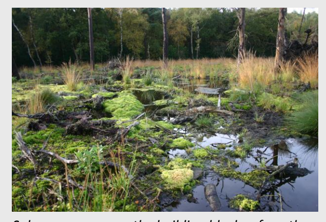
Sphagnum mosses, the building blocks of peatbogs, starting to recover in a re-wetted area of Roudsea Woods and Mosses

The work the Cumbria BogLIFE project has carried is just the beginning. We have put the right conditions in place to allow the bog to restore itself – now we have to be patient! However, we will continue to monitor vegetation cover and water levels to see how the bog responds to the work.