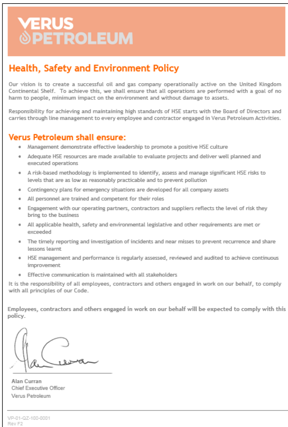
Figure 3-1: Verus Petroleum UK Limited HSE Policy.

In October 2016 the Environmental Management System contained within the HSEMS went through a successful OSPAR 2003/5 re verification audit which was undertaken by ERM CVS.