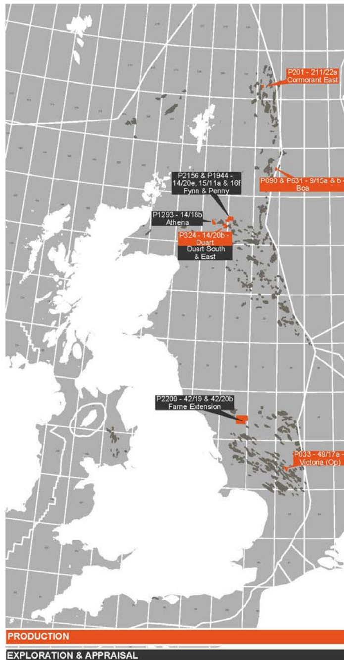
Figure 2-1: Verus Petroleum UKCS Assets

Verus is a growing exploration and production company focussed on the UKCS. The portfolio is a mix of operated and non-operated production and exploration acreage and is shown in Figure 2-1. The operated Victoria Field ceased production on 15 th January 2016.