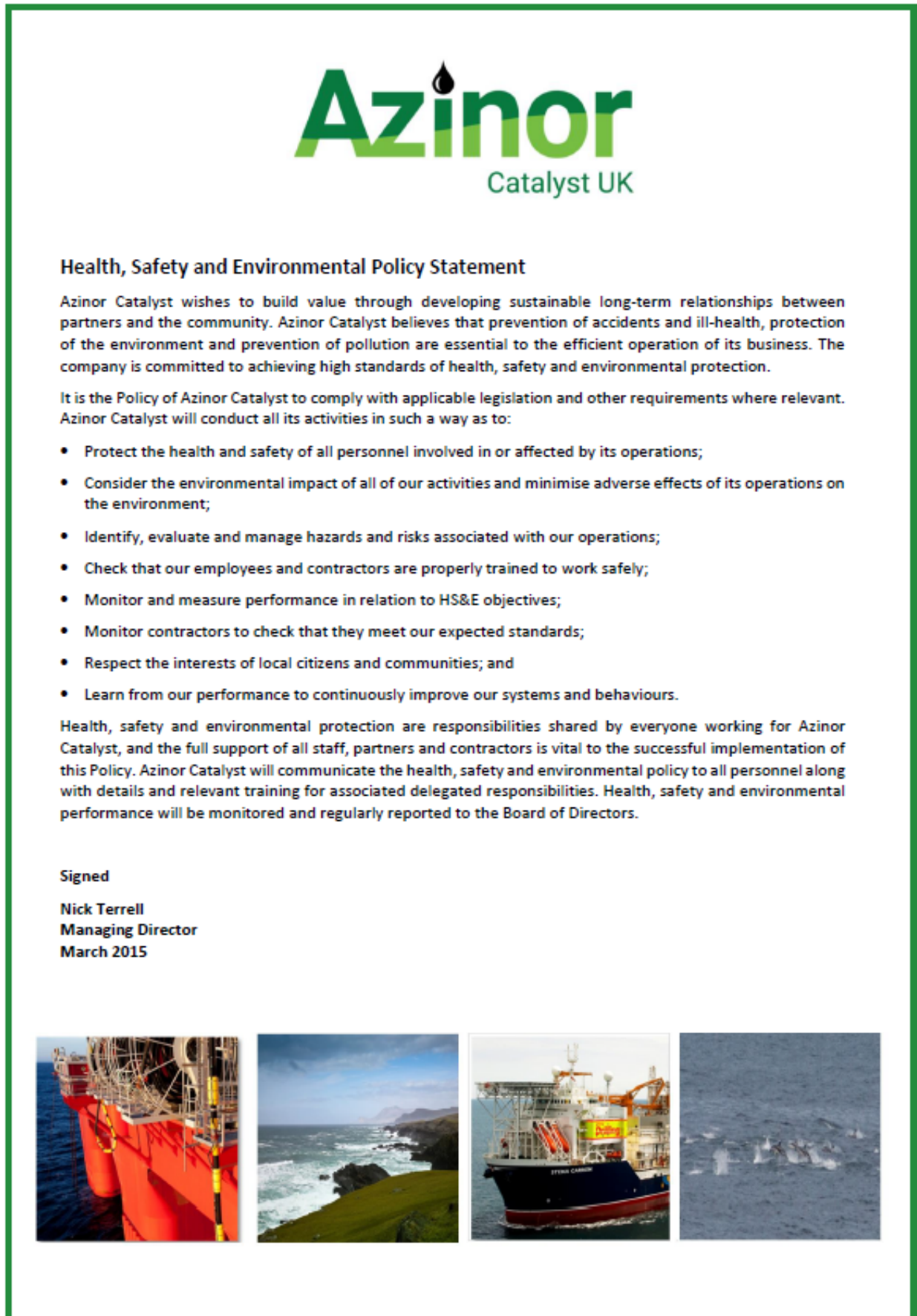
Figure 3-1 AZC's Health, Safety and Environmental Policy Statement