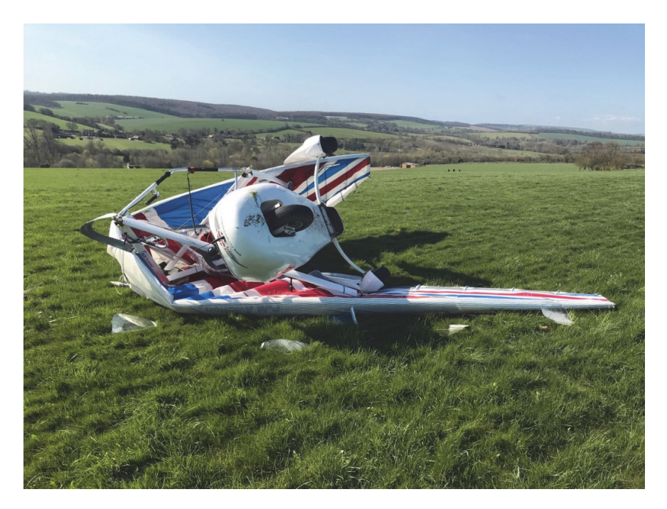
Figure 2 G-FFFA after landing