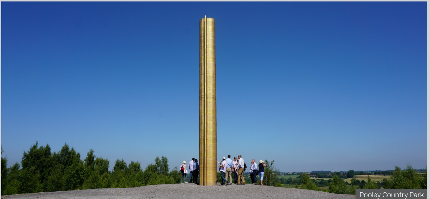
Pooley Country Park