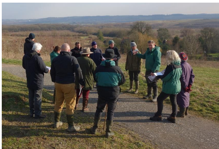
Visit to Marston Vale