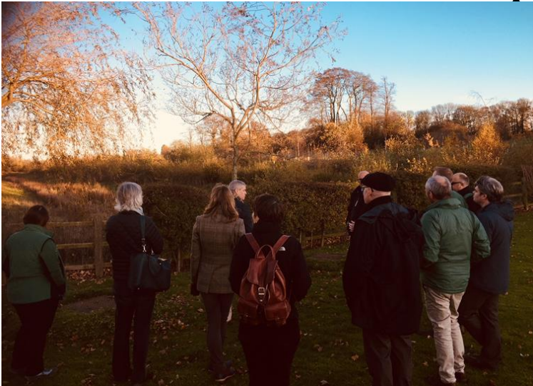
Yorkshire FWAC visit to Castle Hills Hospital

The discussions on the Area Integrated Plans have helped shaped the key forestry and woodlands priorities which include the NFM through the Woodlands for Water Programme, woodland creation opportunities and the importance of protection / resilience.