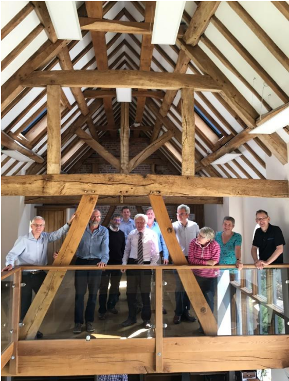
Members visit the Norbury BIFOR site in Staffordshire

The FWAC is supportive of community forests and has welcomed the re-birth of Mercia Community Forest following its loss of core funding from local authority sources. It was pleasing to attend the opening of the new Hilton Community site. Lack of core funding though remains a critical issue and needs to be addressed