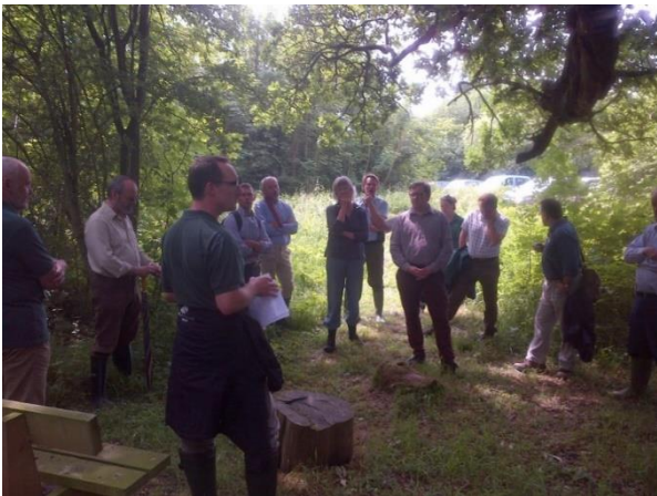
Joint North East and Yorkshire FWAC visit to Robson Spring

Welcomed the overall strategy which recognises the importance of priority habitats as key areas for biodiversity in England. There is however a need to consider their effective management;