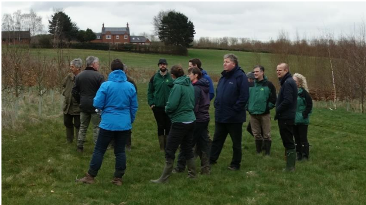
Visit & discussion at the National Forest

The East England FWAC has taken an active role in helping shape the local relationship of the “Defra Group” and, jointly with the East Midlands FWAC, engaged senior managers of Natural England and the Environment Agency to help plot a roadmap of engagement [see East of England report]