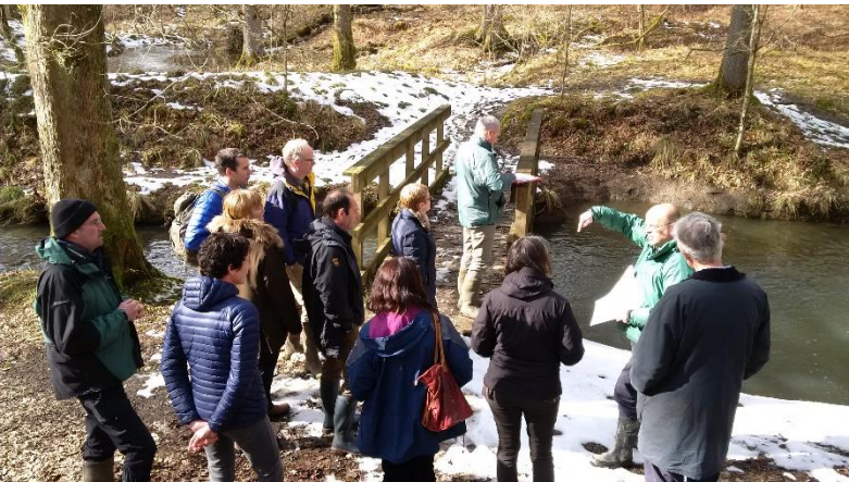
Slowing the flow on the Forest of Dean

The urban agenda was not a specific focus for our meetings this year.