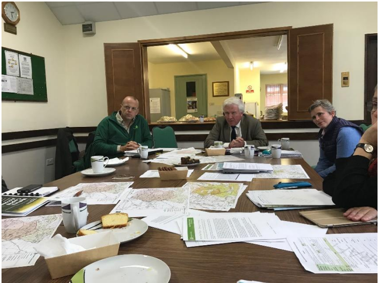
A sub group of the committee hard at work looking at the commercial opportunities of the FE managed site at Hayes Wood

The Committee continues to look to support FE on strategic themes that are brought forward.