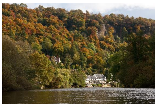
Forestry contributing to our health, the environment& economy