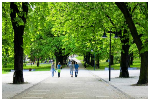
Trees in urban spaces provide multiple benefits to communities