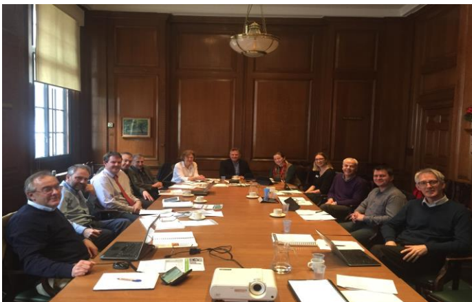
The committee at work