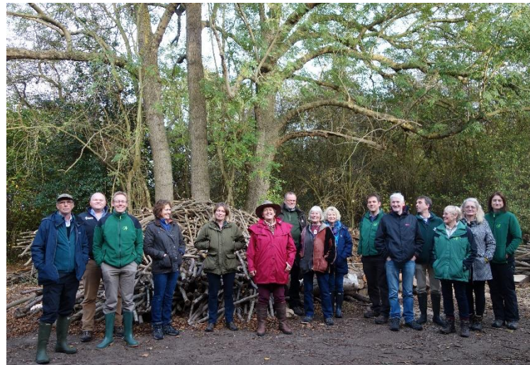
In Bradfield Woods