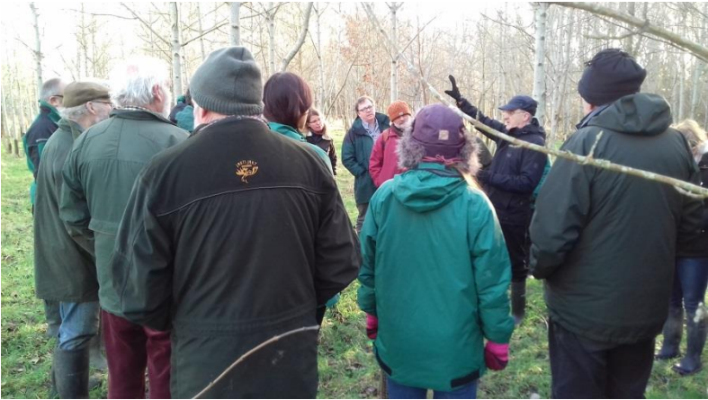
A Tree Health Event

Being so close to Scotland our FWAC is aware of the higher planting rates and are pleased the North East is catching up. The FWAC was pleased to have helped spread the knowledge of the new schemes as well as helping feed their thoughts into the Environment 25 year plan. There is an ongoing appetite to engage with FC and Defra to help address the challenges and opportunities which will arise through Brexit.