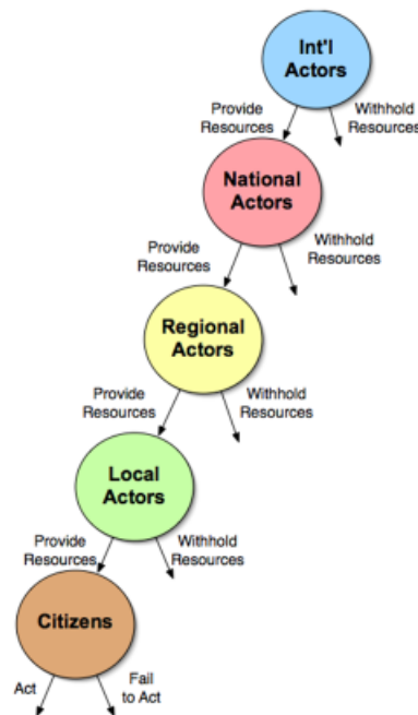
Figure 1: The typical hierarchy of a development aid chain