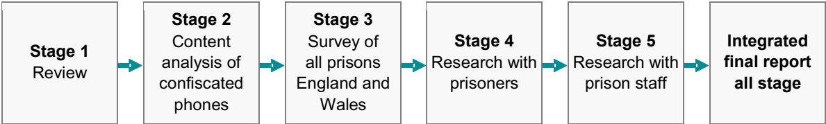
Figure 1: Methodology stages

Stage 1 was a literature review to examine the existing literature on the use of mobile phones in prisons. The review was broadly scoped to encompass a range of jurisdictions and circumstances in which mobile phone use has arisen and/or been tackled by the authorities. The review commenced with searches of the Google Scholar database, 3 employing a mix of direct and more indirect search terms, for example: mobile phones and English prisons; cell phones and US prisons; smuggling, prison contraband and cell phones; corrupt officers/guards and smuggling contraband goods; measures to prevent mobile phone use in prisons; prisoners on Facebook sites and so on. In addition to the UK, the geographical areas for which material was collated included the USA, Ireland, Canada, Australia and Europe. Nonetheless, it quickly became apparent that there was a paucity of studies which directly and systematically address the research questions listed above. 4 For example, the review did not unearth any research study seeking to provide estimates for the incidence of mobile phone possession and/or use among a specific prison population, including variations in use across different categories of prisoner. Due to an initial lack of studies, the review also conducted a wider search using Google to pick up on some of the other evidence in relation to mobile phone use in prisons. This mainly identified media reports of mobile phone usage.