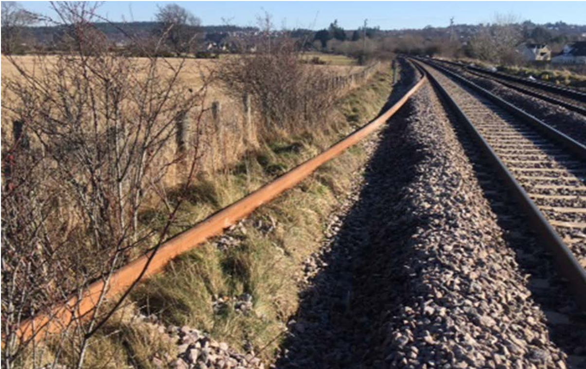
The rail after being struck by the train