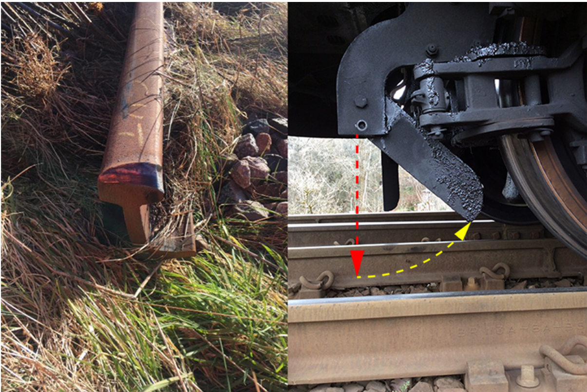
(Left-hand image) the end of the rail, showing the impact mark and (right-hand image) the damaged lifeguard