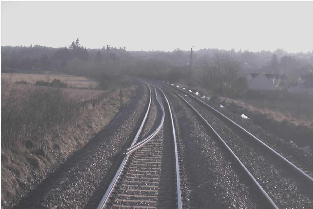
Image from Forward Facing CCTV of train 1E17 showing the rail just prior to impact