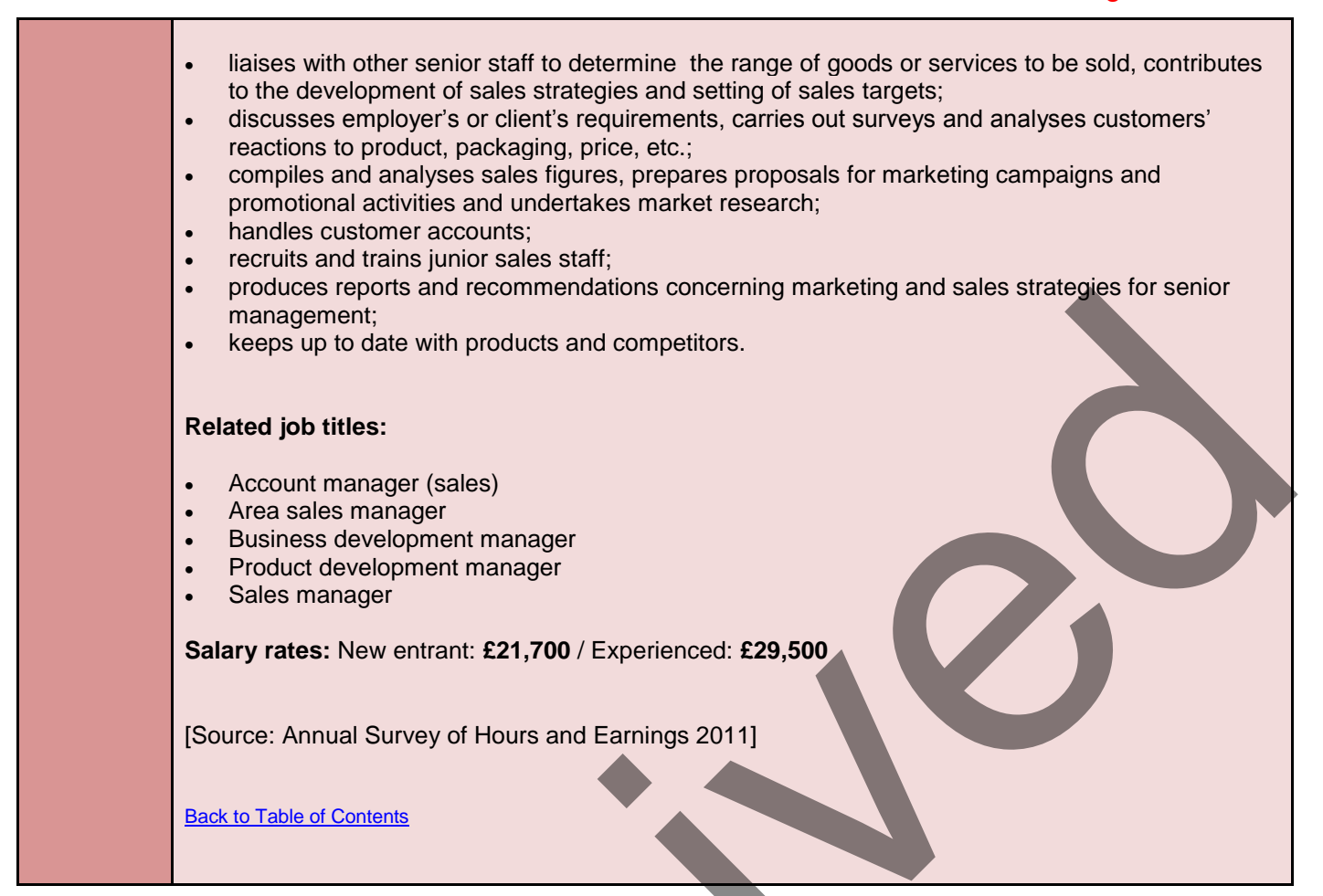
Table 3: Occupations skilled to NQF level 4