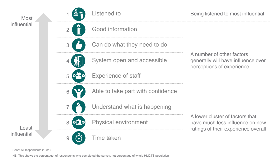
Figure 3: Key driver analysis model

Although being listened to was the most important element influencing overall ratings of experience, other elements were also influential in shaping perceptions of experience. These include having information that is good enough, elements related to being able to participate well, and staff. Understanding what is happening, the physical environment (e.g. court buildings and facilities), and the time taken had much weaker influence on overall ratings of experience.