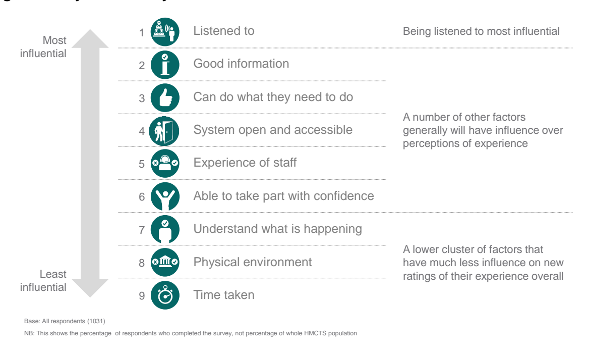
Figure 1: Key driver analysis model