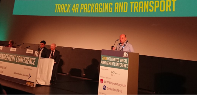
facilitated many lively and stimulating side discussions."

"The Conference was a tremendous networking forum and NWS/007/2018