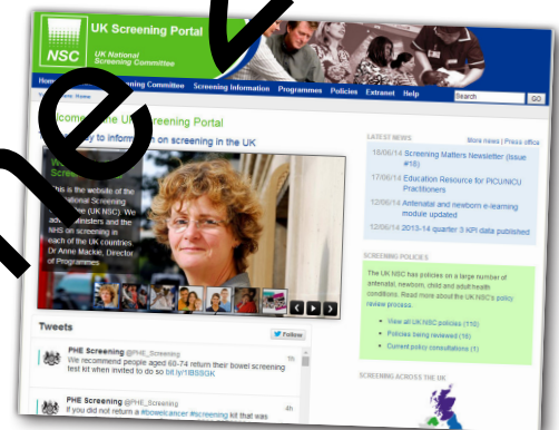
The current UK Screening Portal

Look out for more information over the coming months.