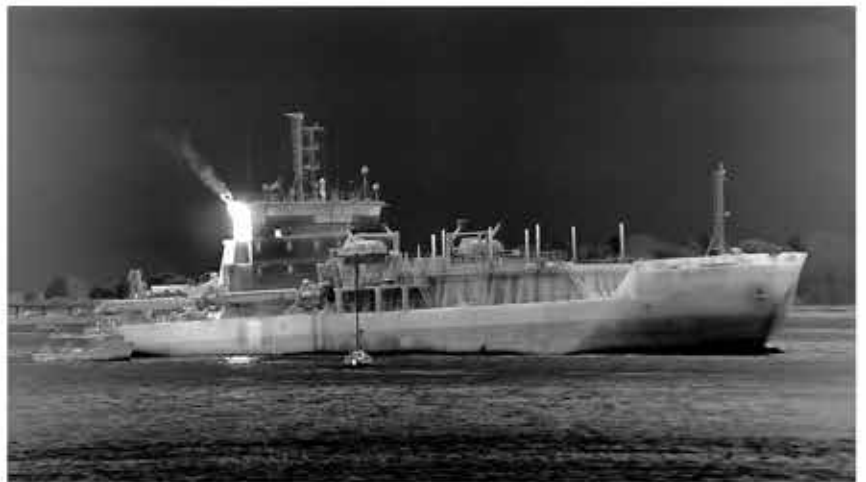
Unprocessed IR video frame - HD

Multi-spectral imaging without compromise