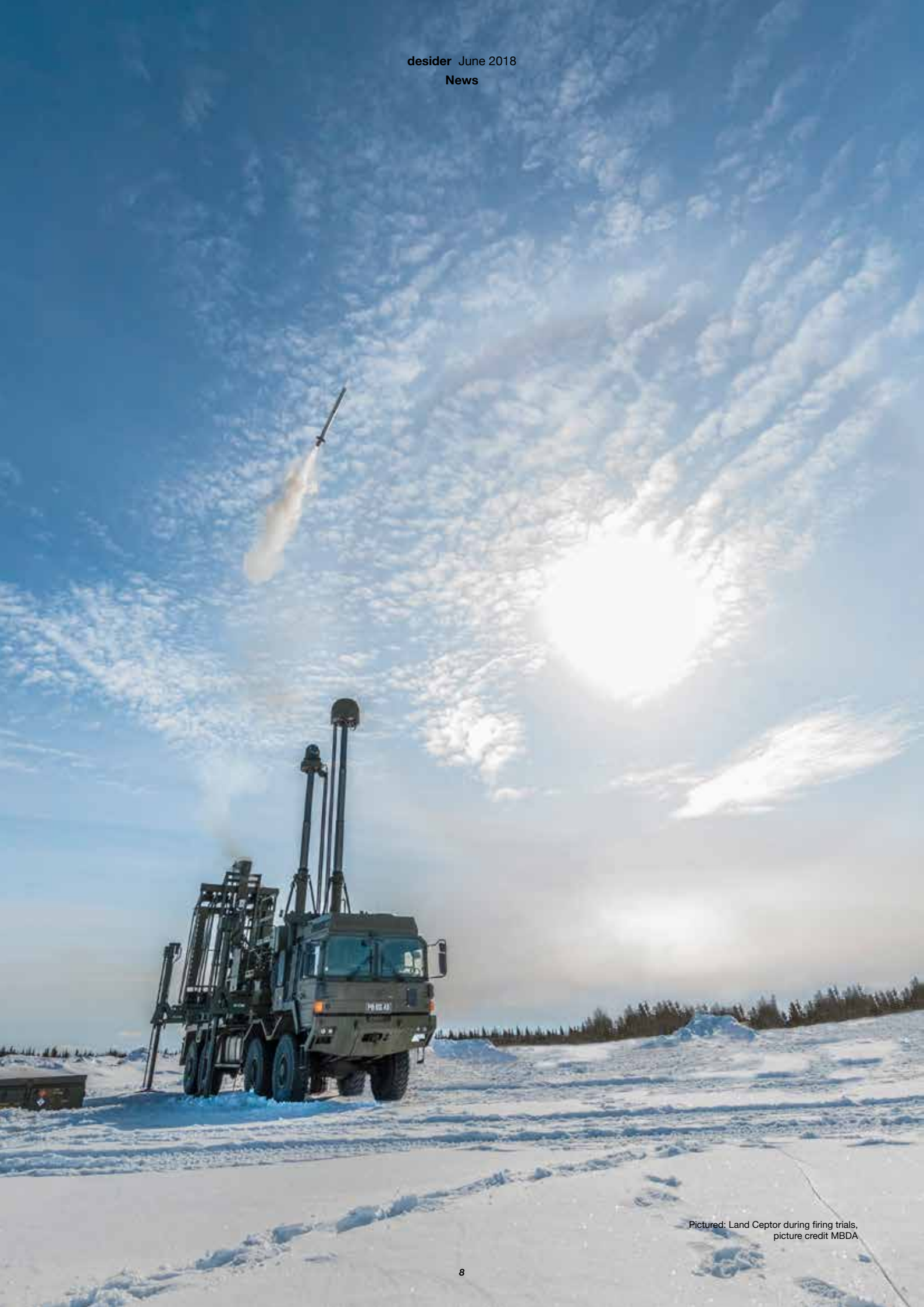
Pictured: Land Ceptor during firing trials