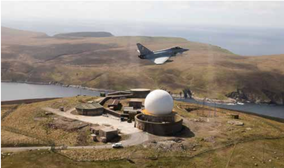
A RAF Typhoon flies over the RAF's Air Defence Radar delivered by the DE&S Air Defence and Electronic Warfare Systems Team at Saxa Vord, on the Island of Unst, Shetland.