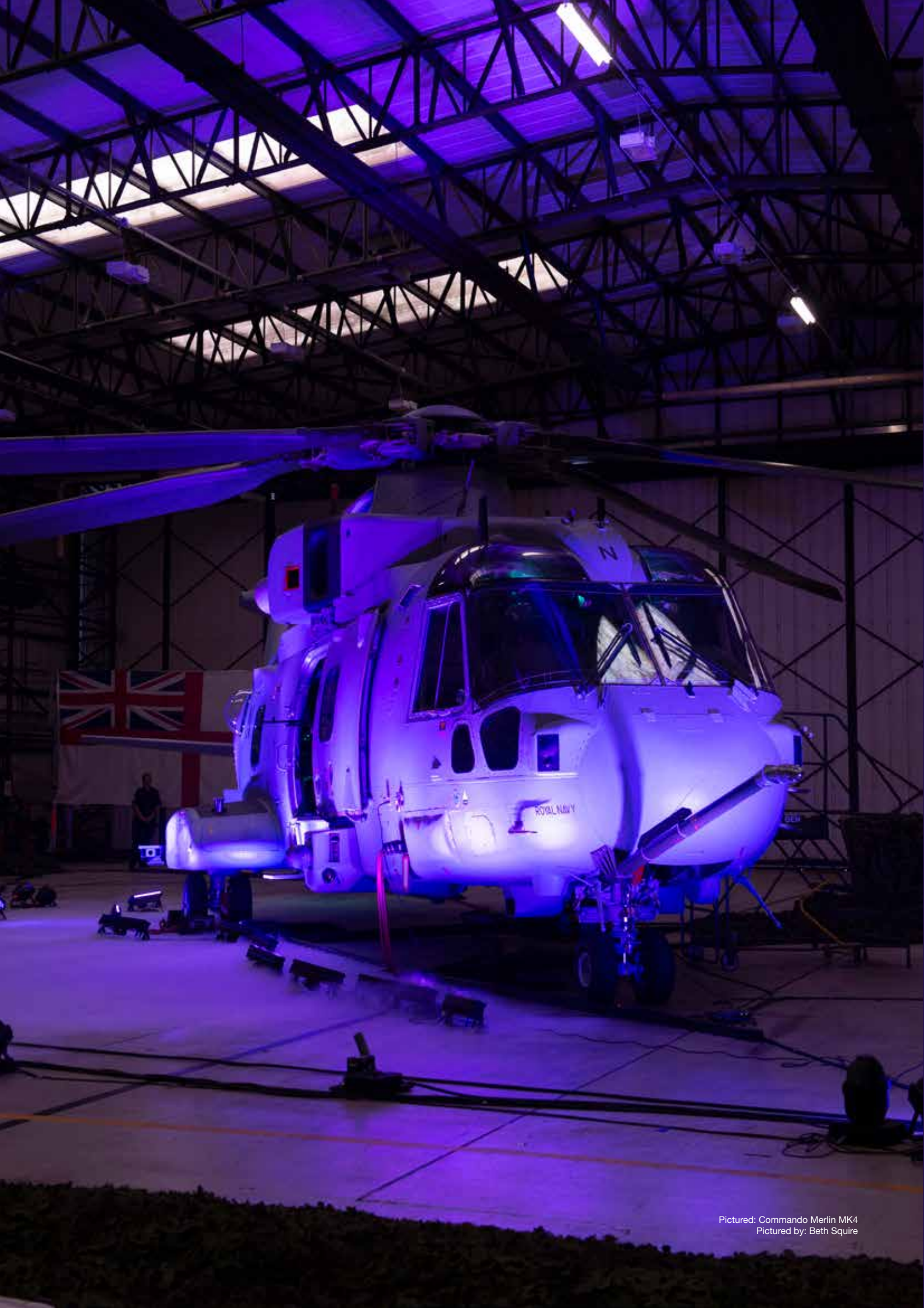
Pictured: Commando Merlin MK4