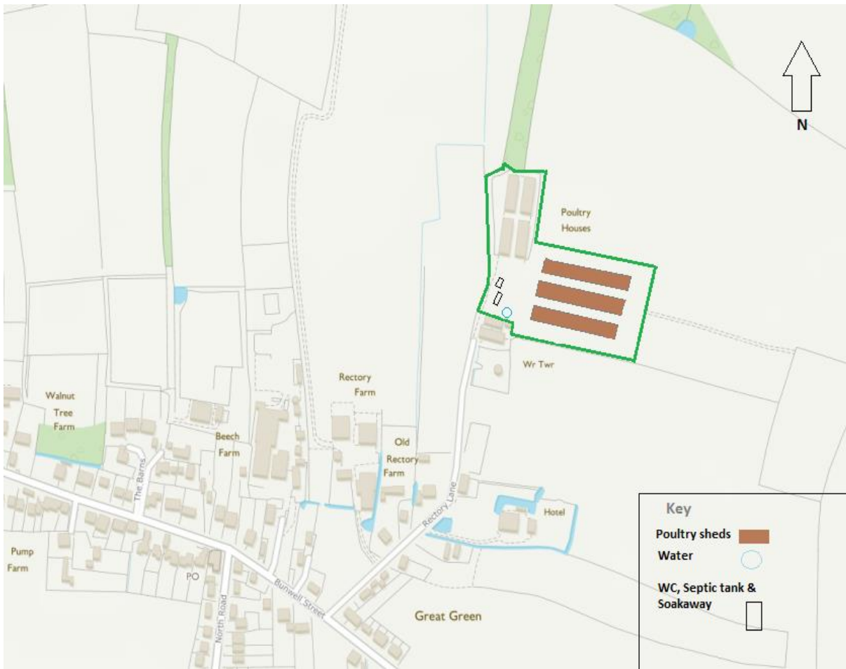
Site plan - showing installation boundary as referred to in condition 2.2.1.