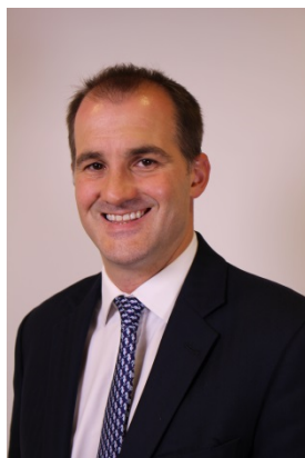
Jake Berry MP

The government is committed to supporting our coastal towns and to help them grow. We are keen to see the heritage assets that define our coast deliver economic benefits for the communities that live in them and to become buildings that once again draw visitors to our coastlines.