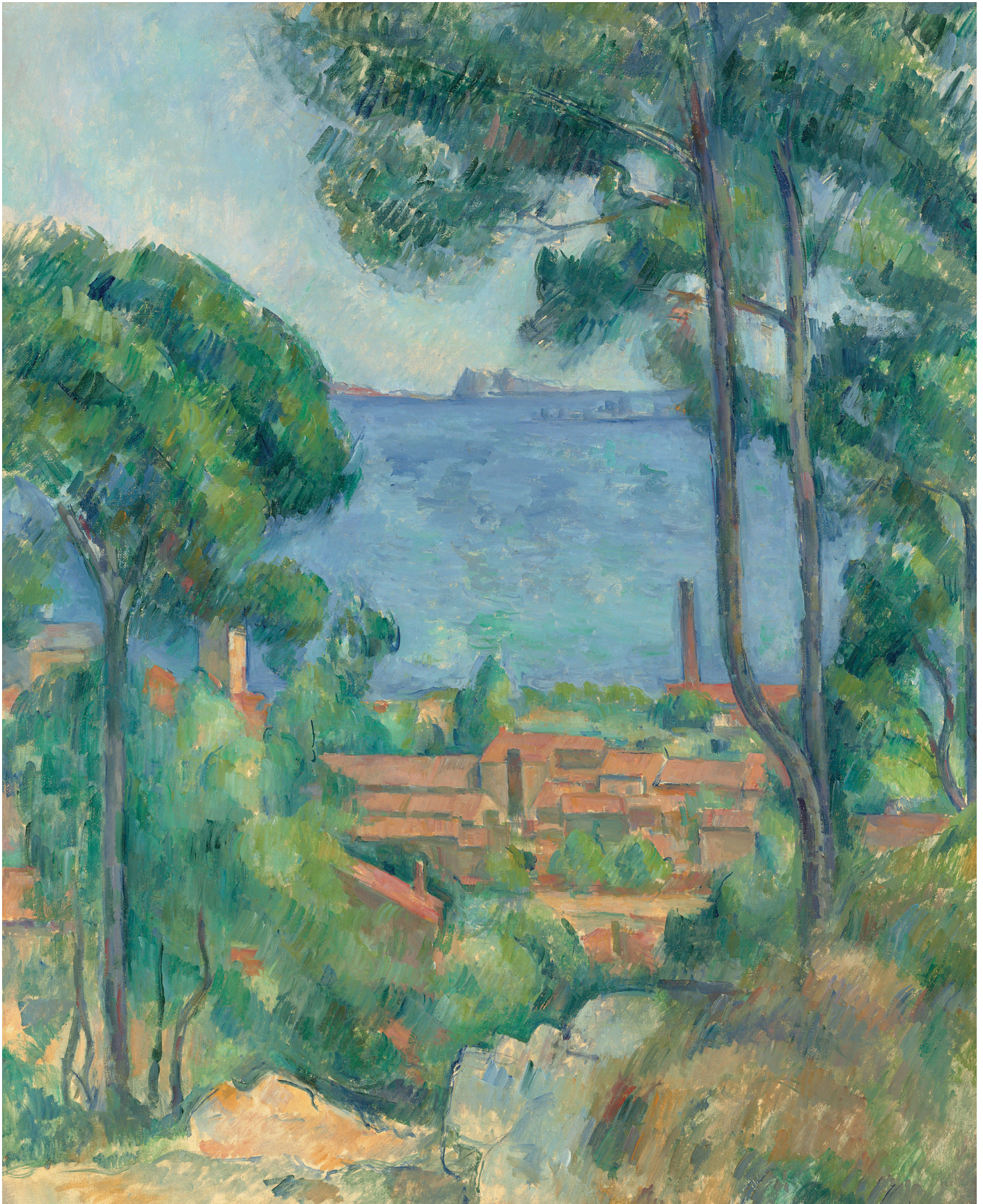
Plate 1 Vue sur L'Estaque et le Château d'If , by Paul Cézanne