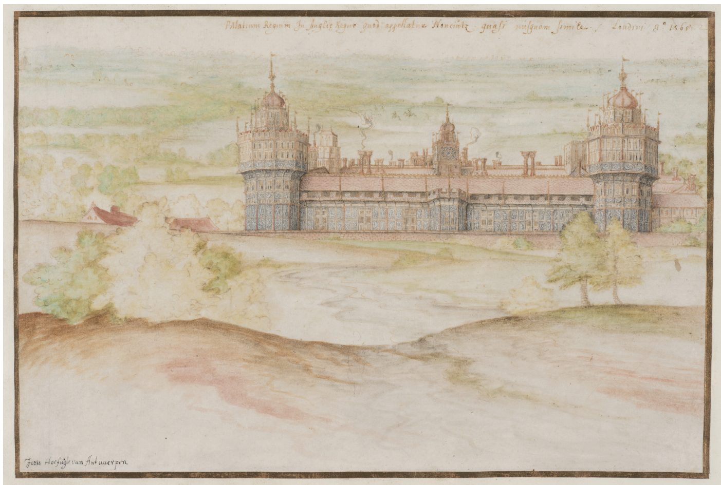
Plate 16 Nonsuch Palace from the South by Joris Hoefnagel