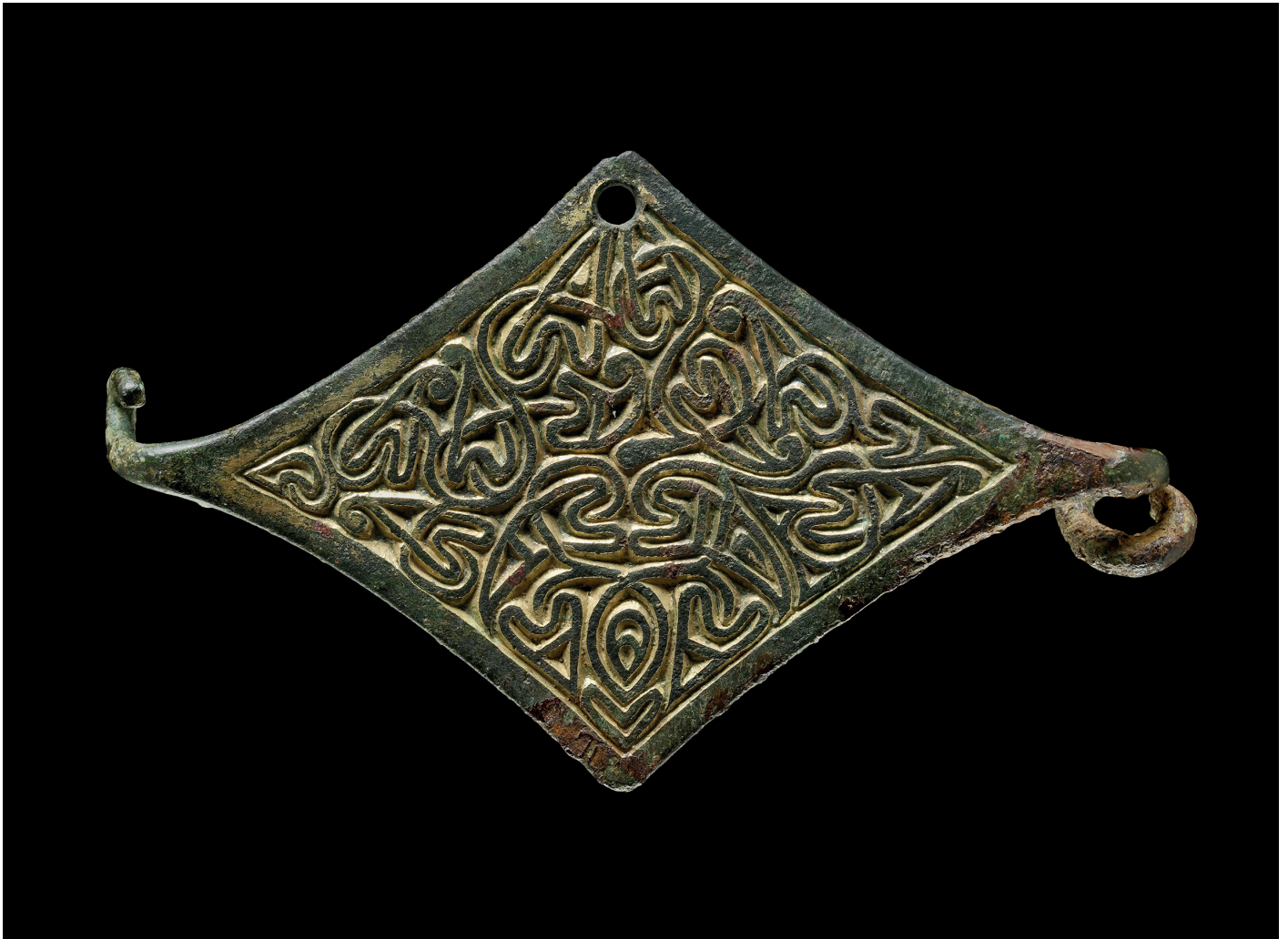
AN2016.151 Lozenge-shaped brooch, late 8th century AD