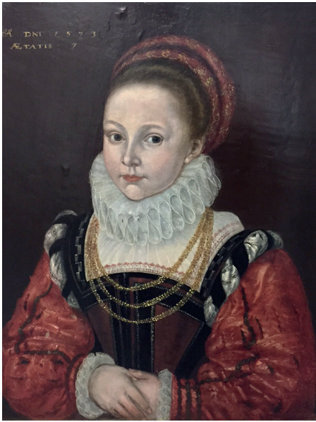
Plate 20 A set of nine portraits of the Smythe Family by Cornelius Ketel