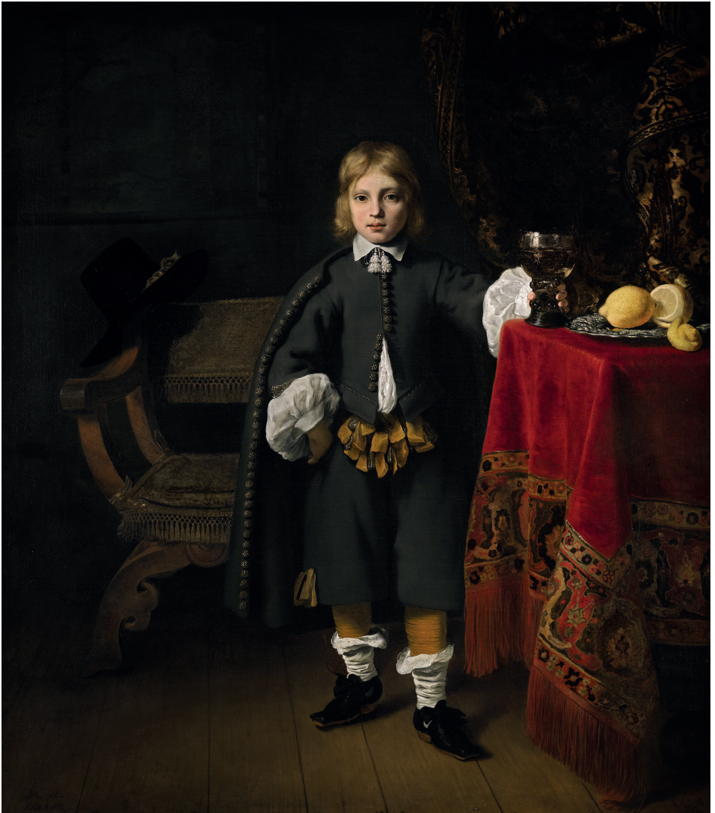
Plate 12 Portrait of a Boy by Ferdinand Bol