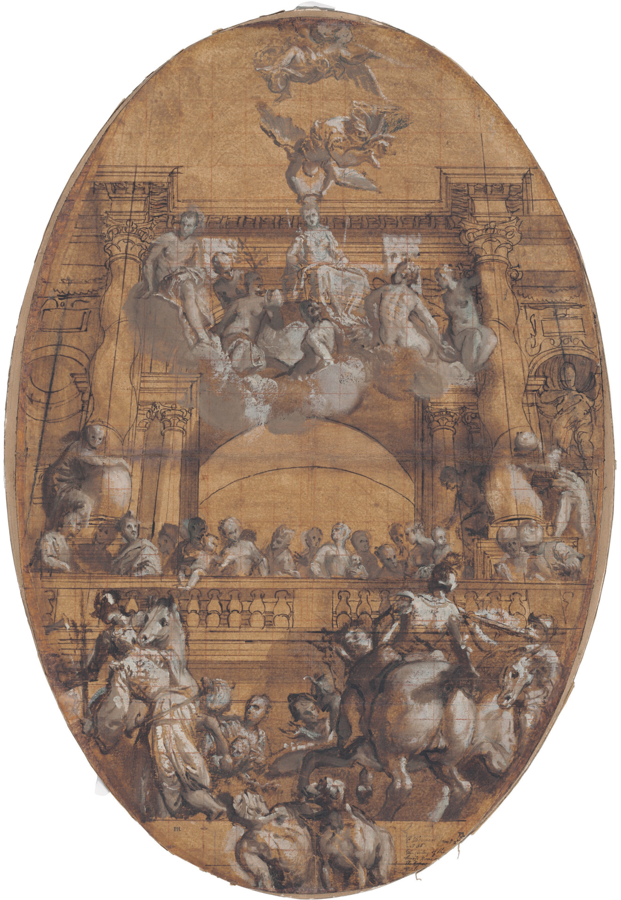
Plate 18 Venice Triumphant , a drawing by Paolo Veronese