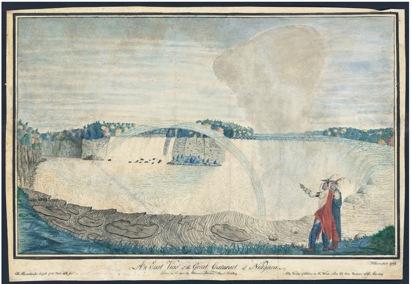
Plate 3 An East View of the Great Cataract of Niagara, by Captain Thomas Davies