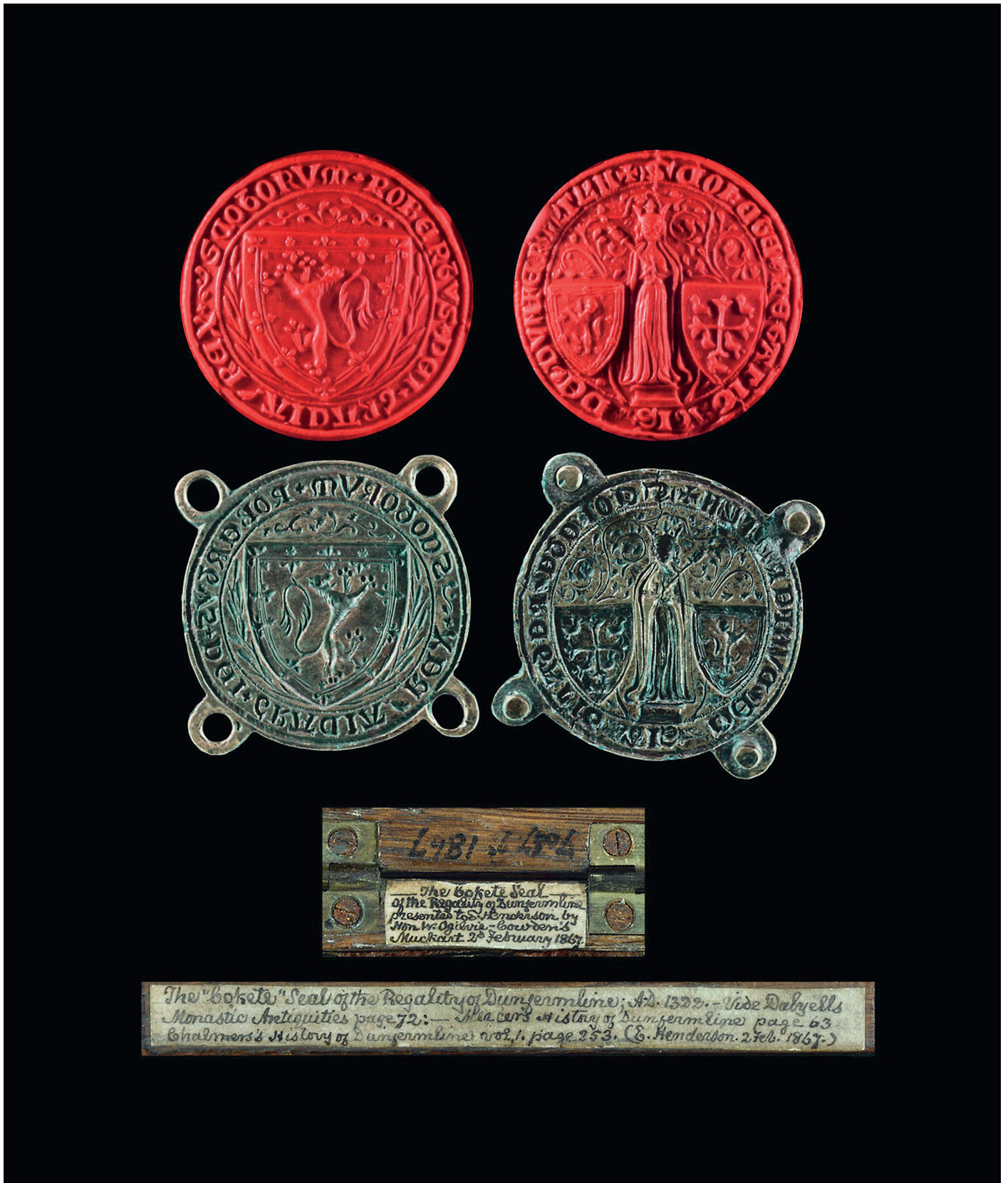
Plate 17 Medieval King Robert the Bruce of Scotland and Dunfermline Abbey Cokete Seal Matrix Pair