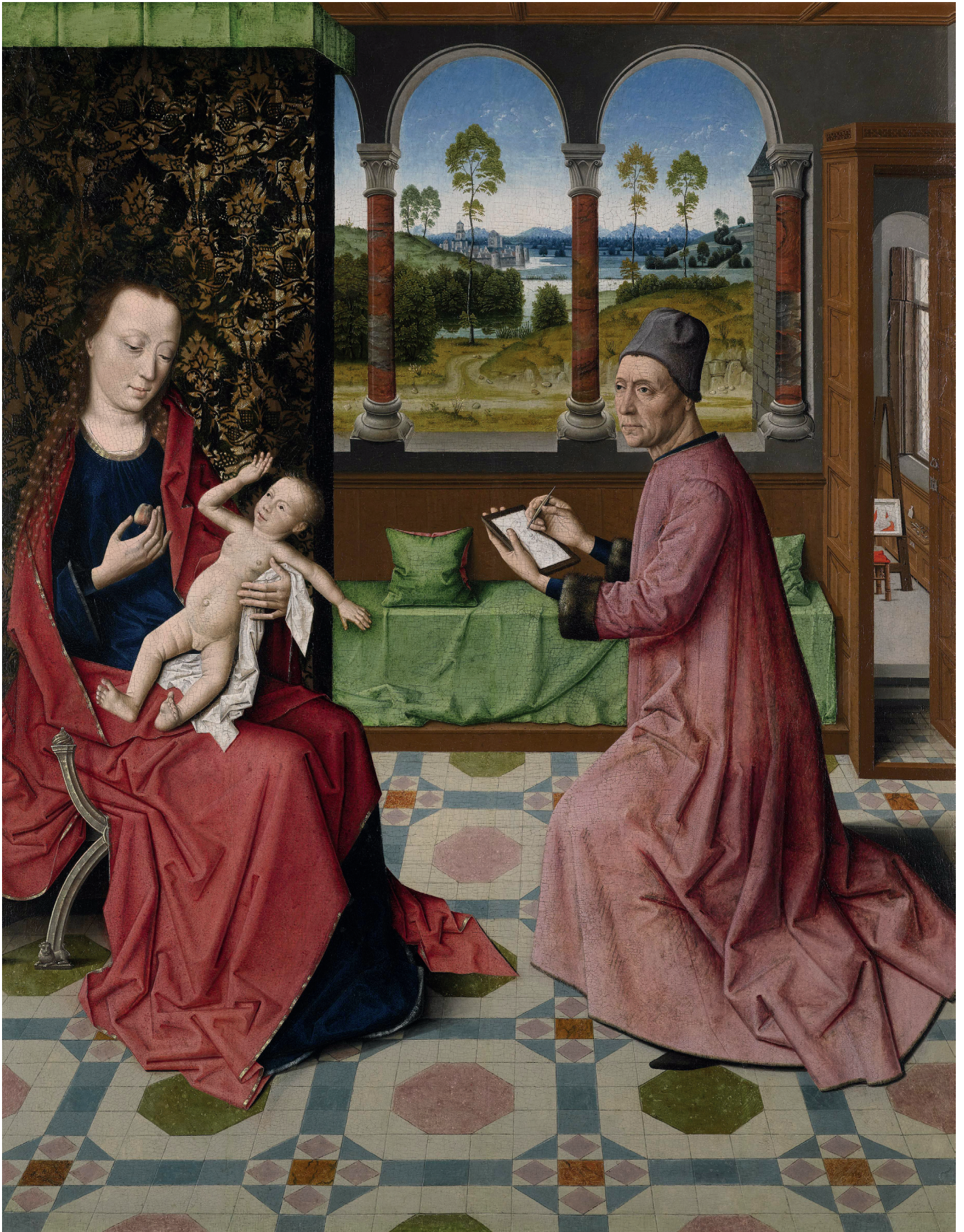
Plate 7 St Luke Drawing the Virgin and Child from the workshop of Dieric Bouts the Elder